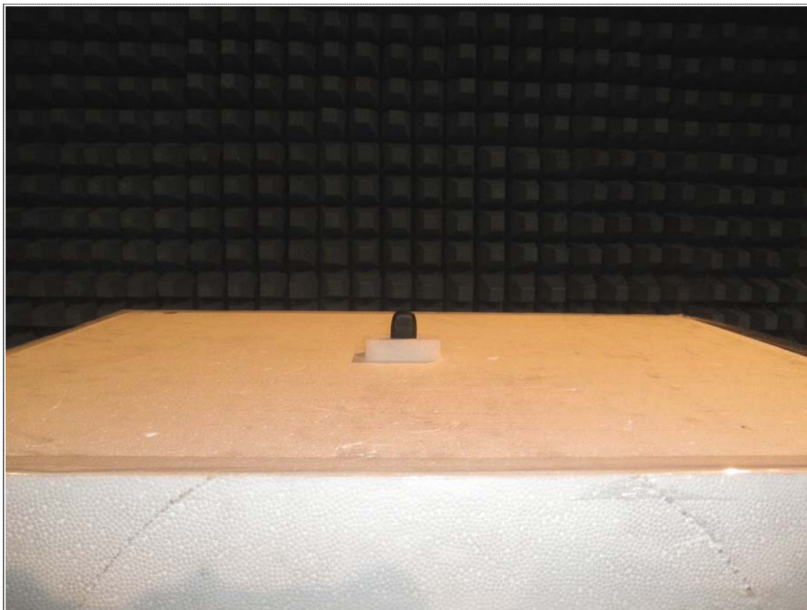
Rear View (Frequency above 1GHz)