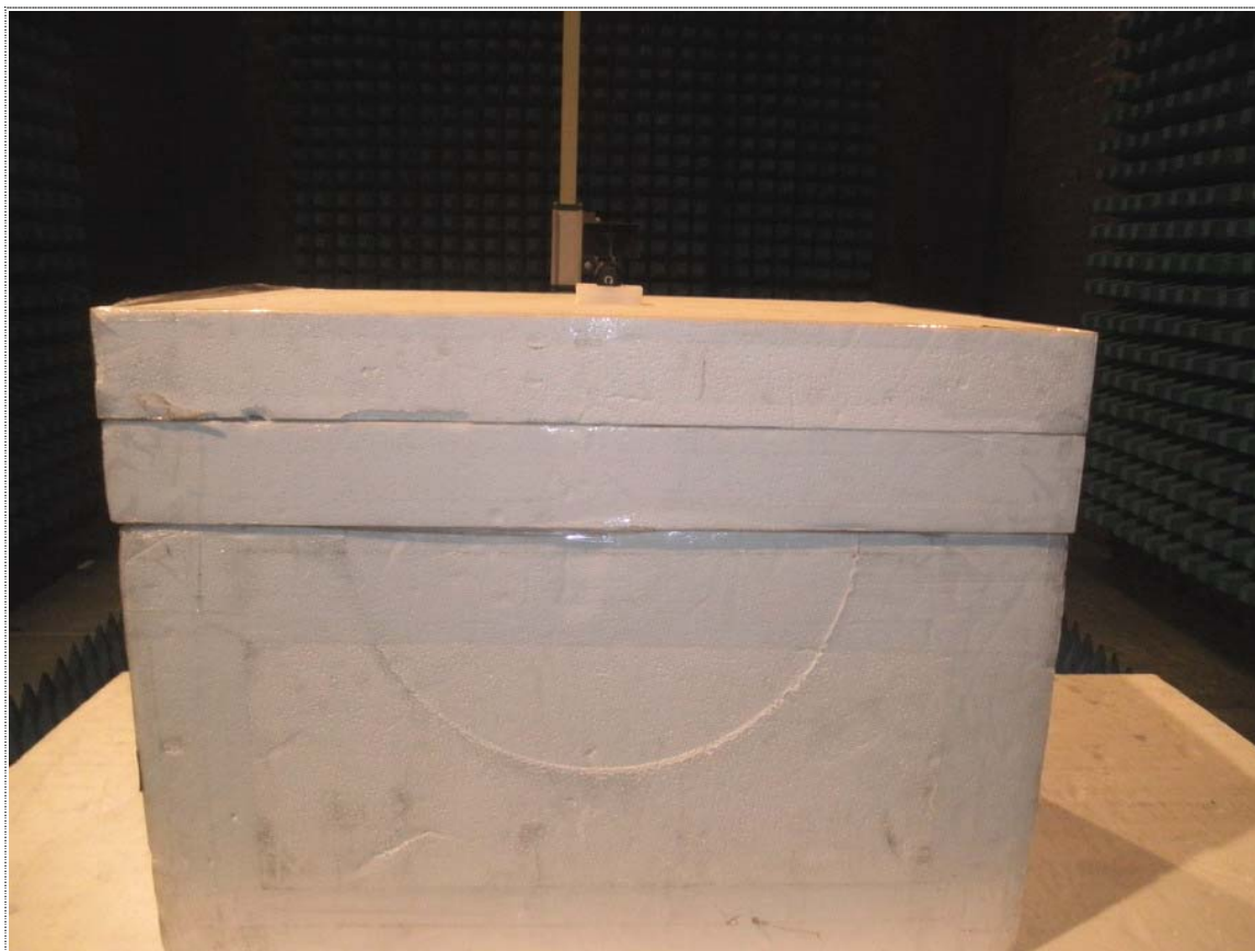
Front View (Frequency above 1GHz)