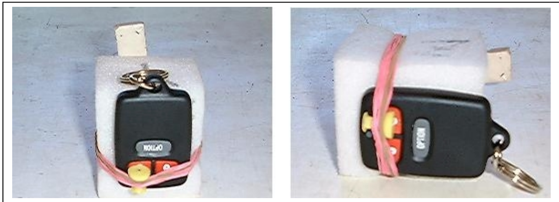
Radiated Open Site Test Set-up