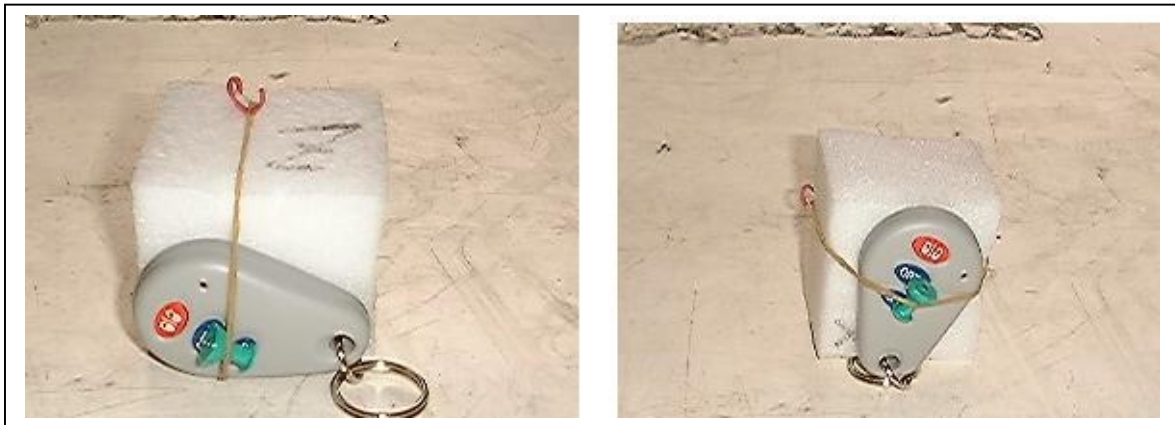
Radiated Open Site Test Set-up