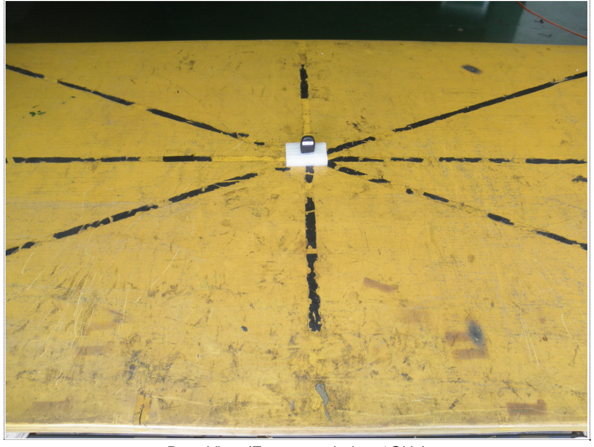
Rear View (Frequency below 1GHz)