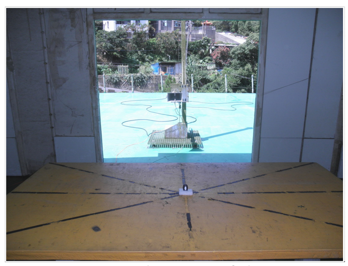
Front View (Frequency above 1GHz)