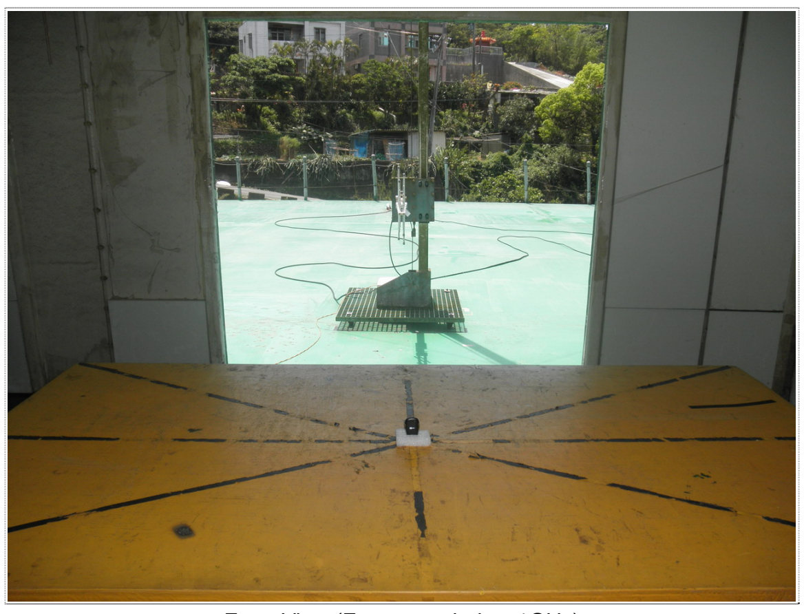
Front View (Frequency below 1GHz)