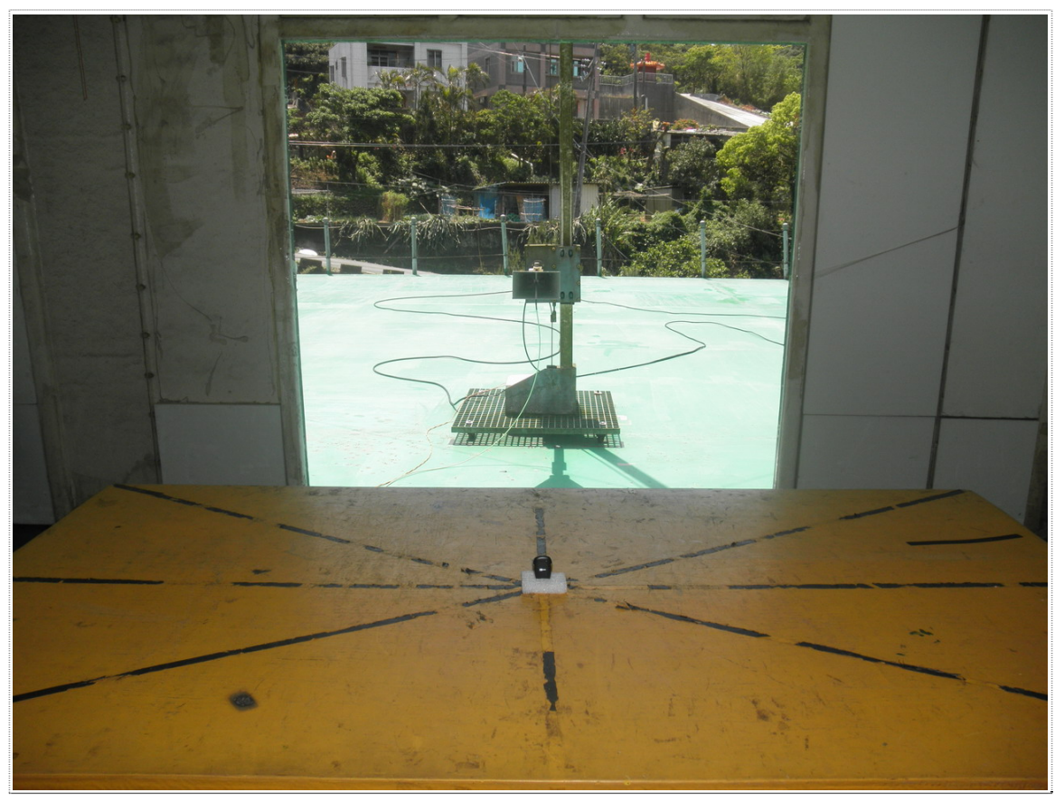
Front View (Frequency above 1GHz)