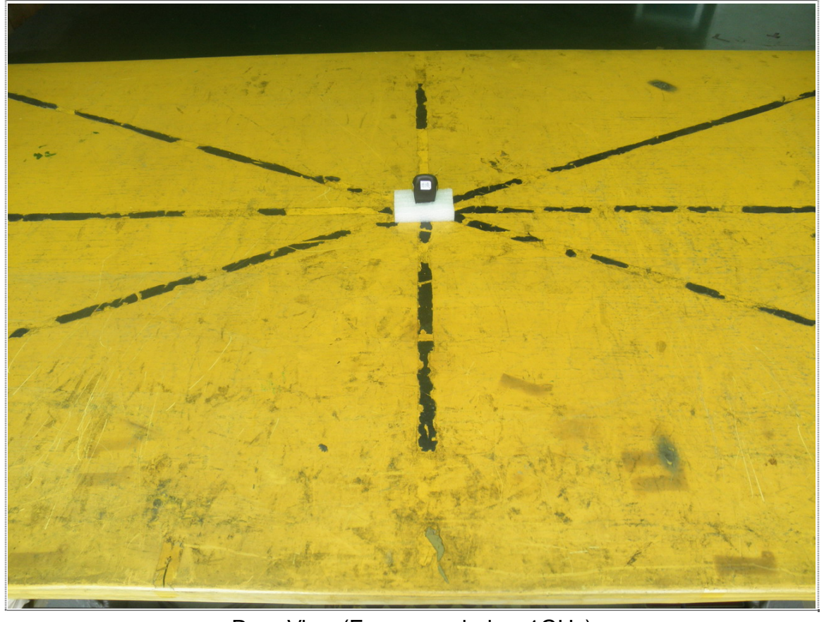
Rear View (Frequency below 1GHz)