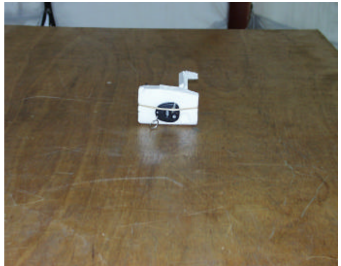
Radiated Open Site Test Set-up