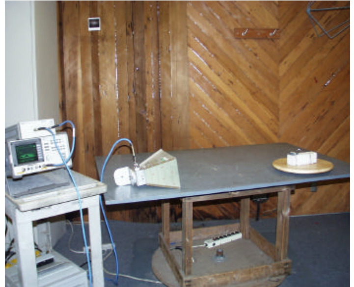
Radiated Open Site Test Set-up