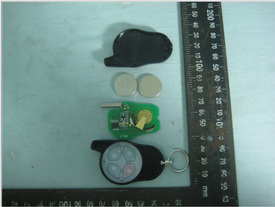
Inner View of EUT