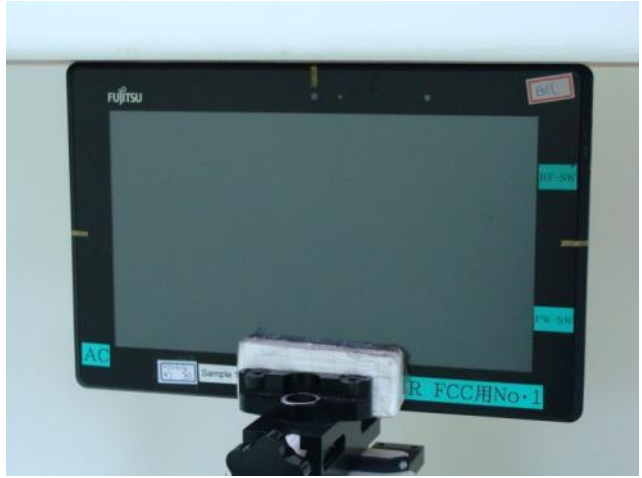
Edge 1 with Phantom 0 cm Gap