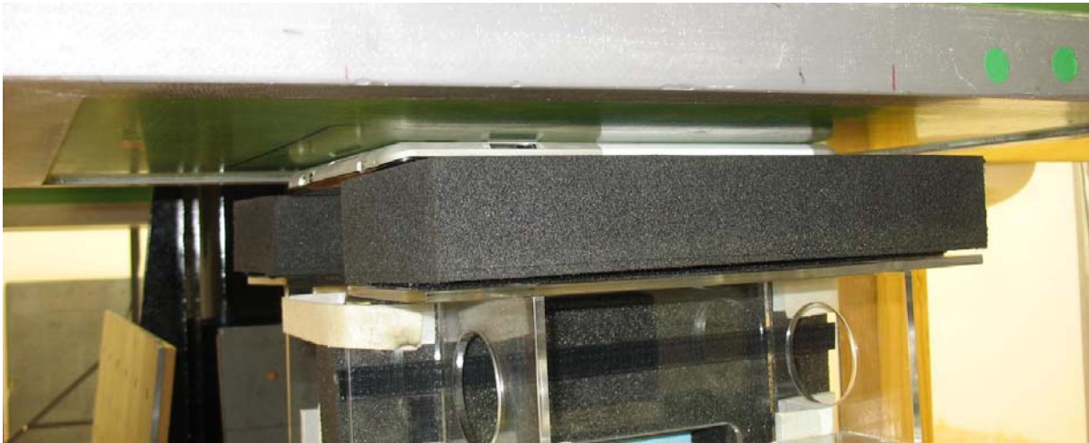
Lap Held Position