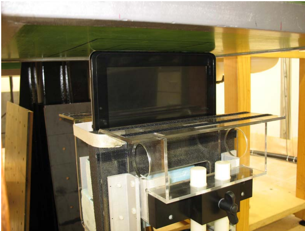
Edge On Position (secondary landscape)