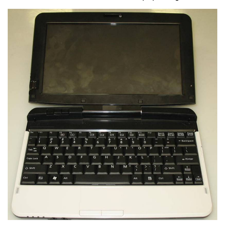
T580 / TH550 Host - Tablet Configuration

T580 / TH550 Host - Conventional Laptop Configuration