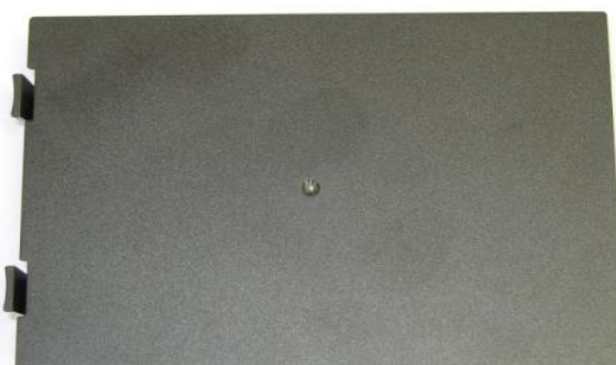
622ANHMW inside the Fujitsu TABLET Computer