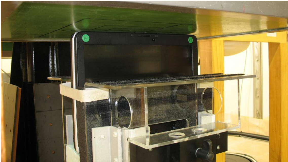
Edge On Position (Secondary Landscape)