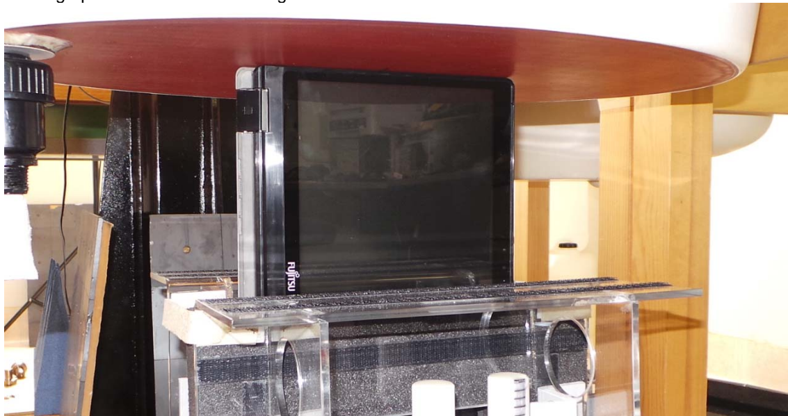
Photograph Number 15. Edge 4 Position