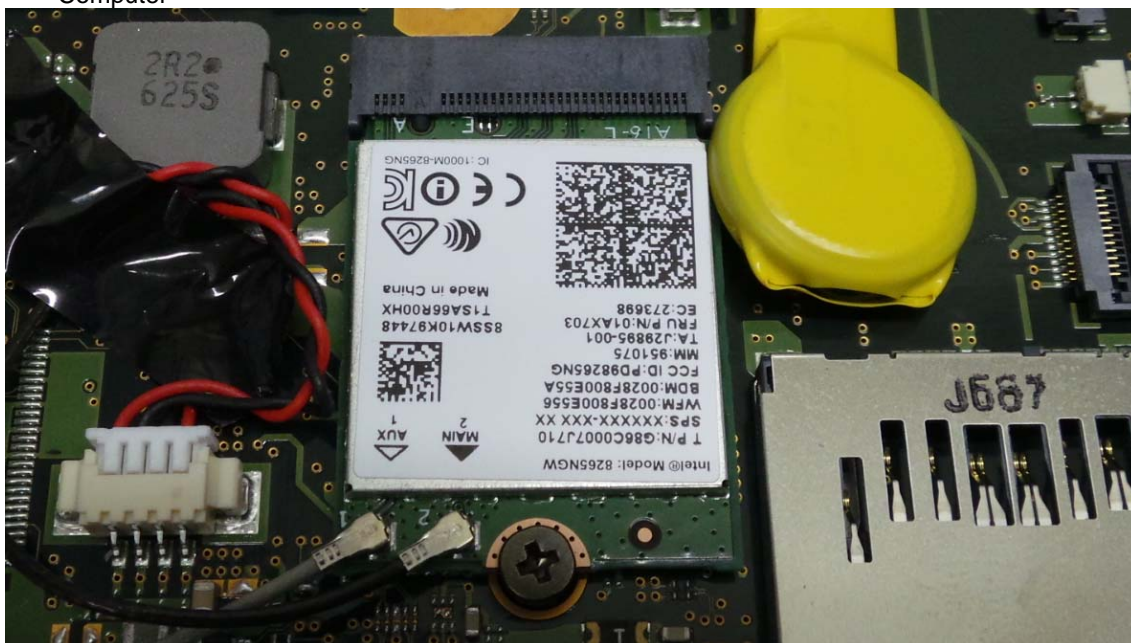
8265NGW inside the Fujitsu P Series LIFEBOOK Convertible