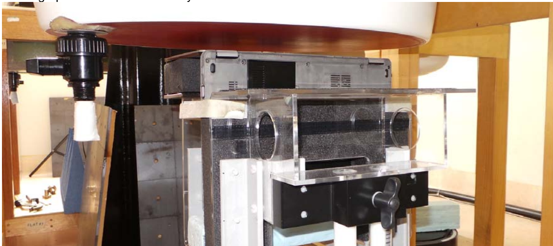
Photograph Number 17. Bystander Position