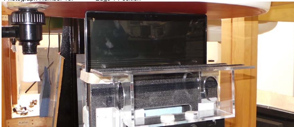
Photograph Number 11. Edge 1 Position