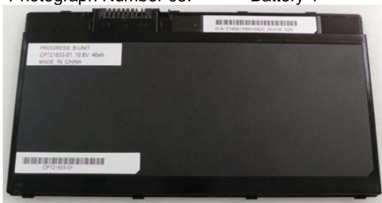
Photograph Number 05. Battery 1