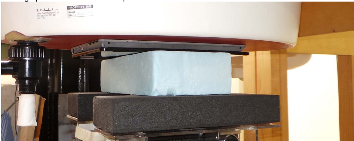
Photograph Number 09. Lap Held Position