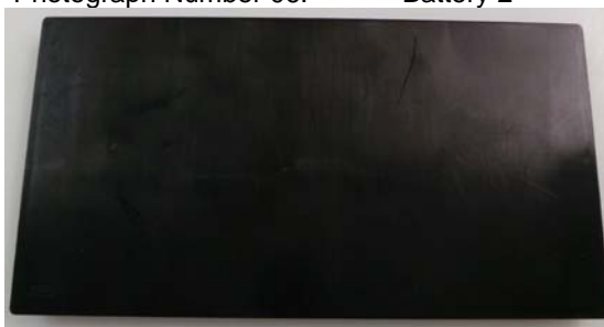
Photograph Number 06. Battery 2