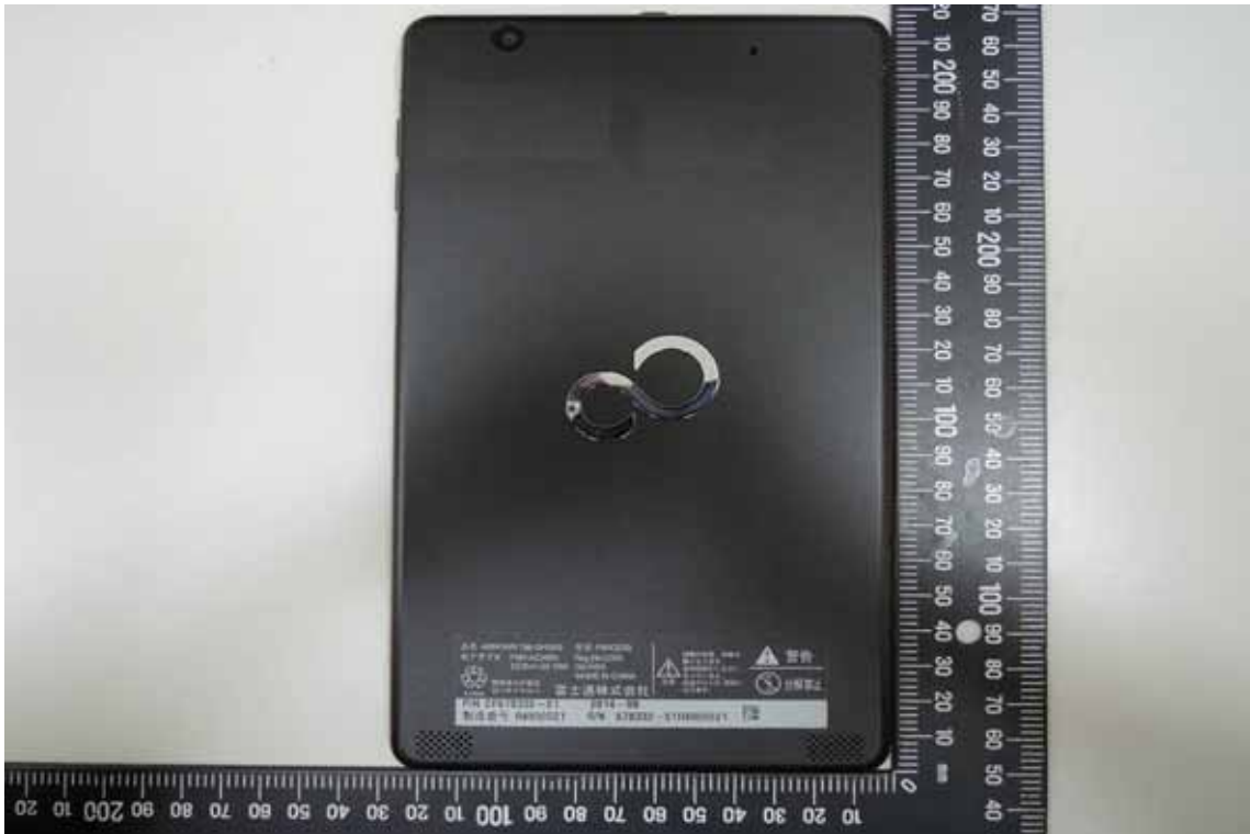
Side View of EUT – 1