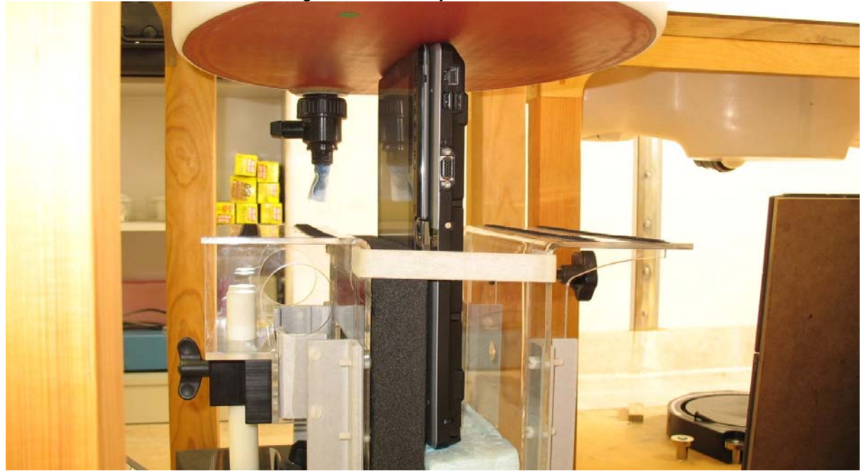
Edge On Secondary Portrait Position