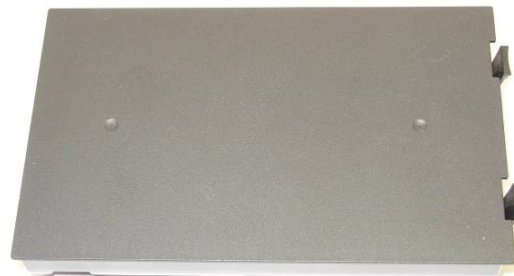
533AN_HMW inside the Fujitsu TABLET Computer