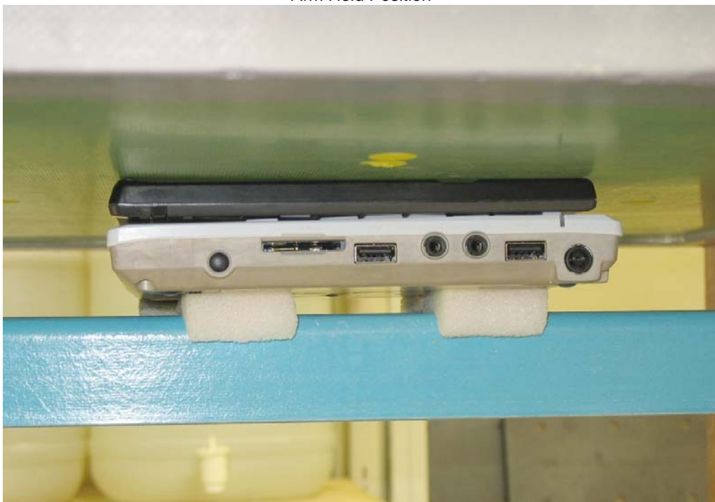
Arm Held Position