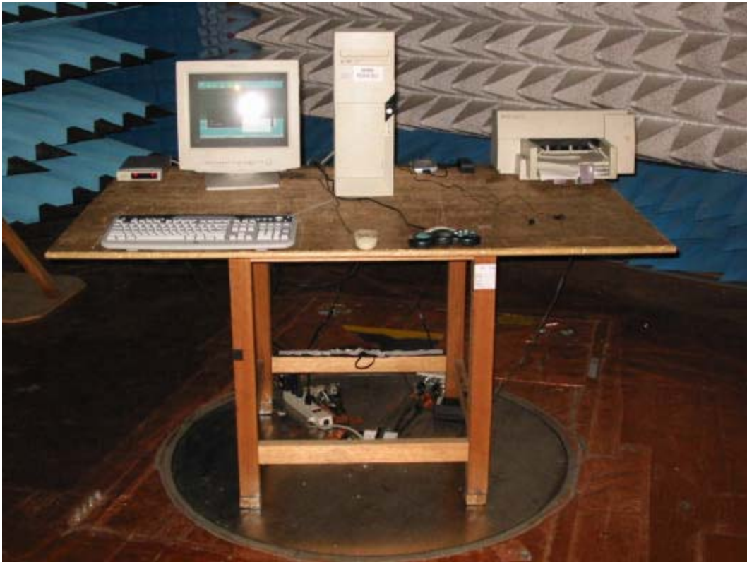
Front View of the Test Configuration of Unintentional