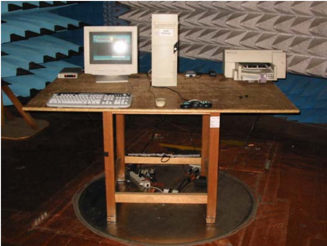
Front View of the Test Configuration of Unintentional