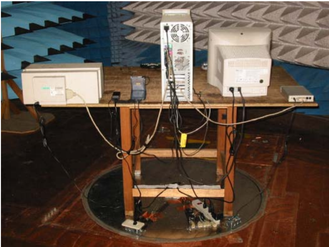
Rear View of the Test Configuration of Unintentional