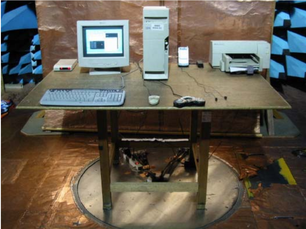
Front View of the Test Configuration