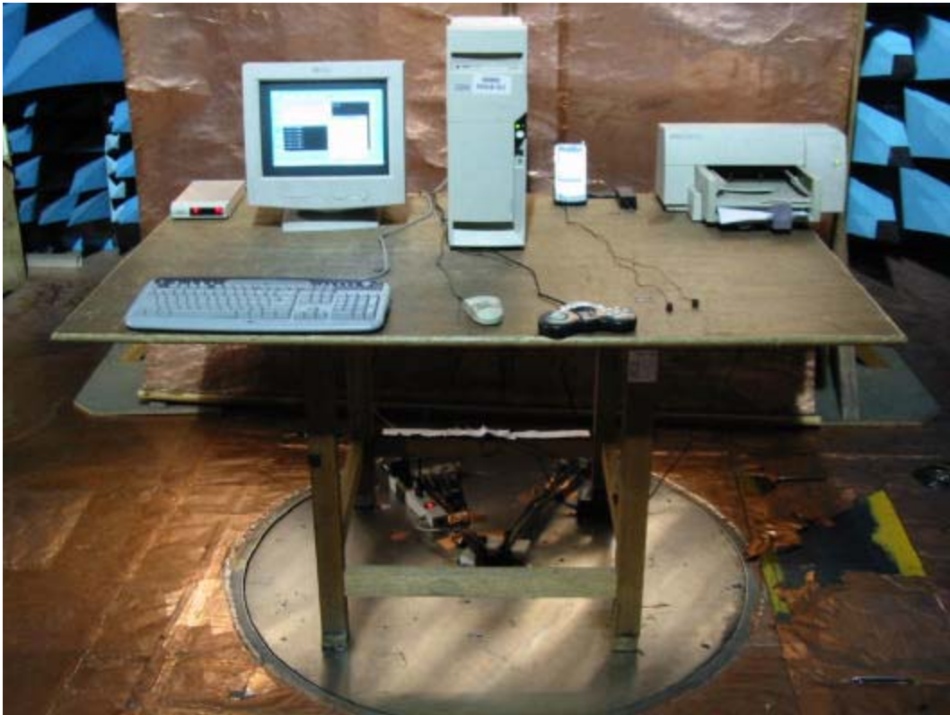
Front View of the Test Configuration