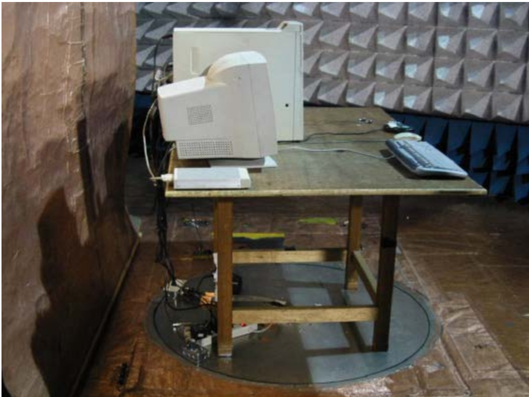
Side View of the Test Configuration