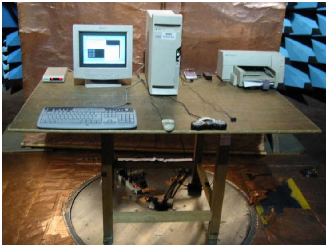
Front View of the Test Configuration