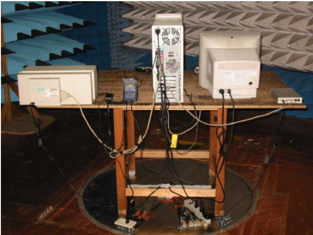
Rear View of the Test Configuration of Unintentional