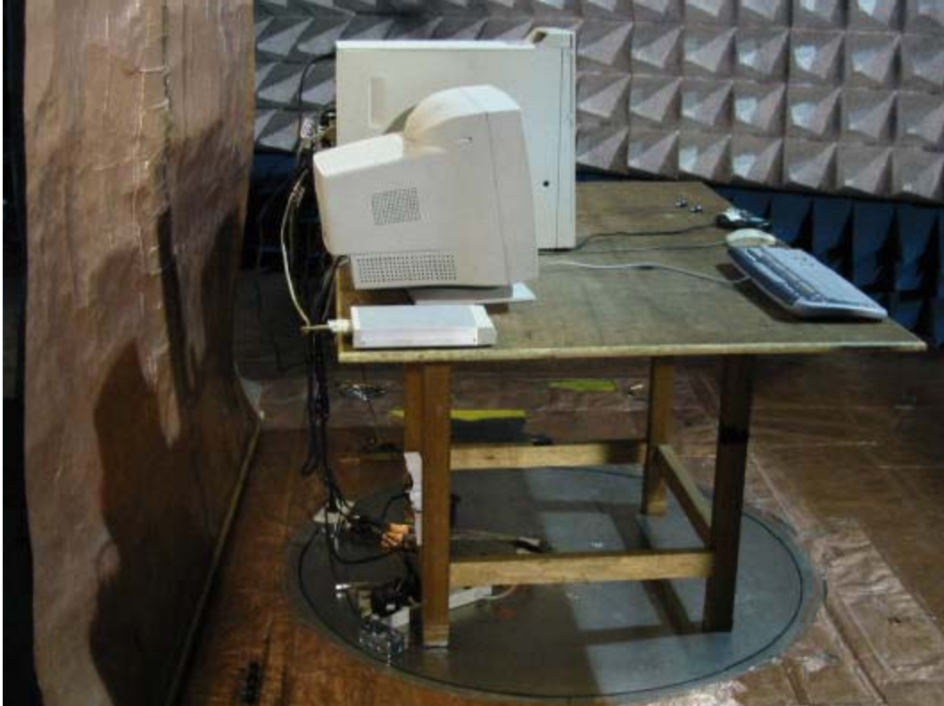
Side View of the Test Configuration