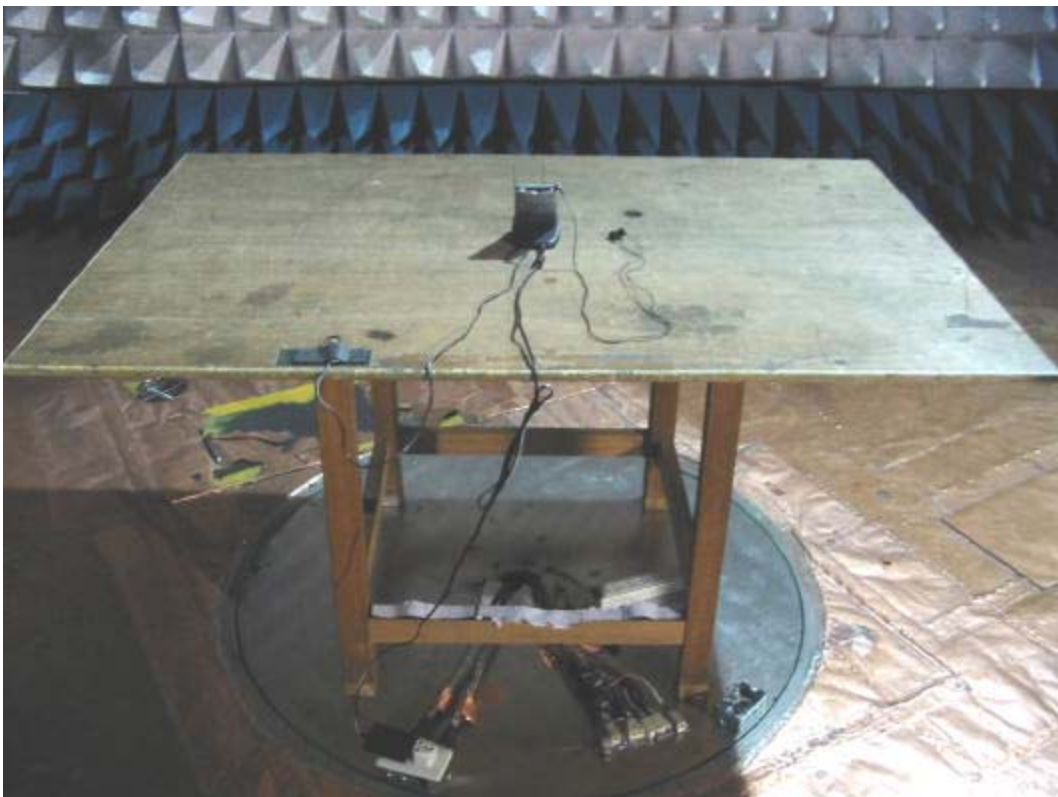
Rear View of the Test Configuration of Intentional