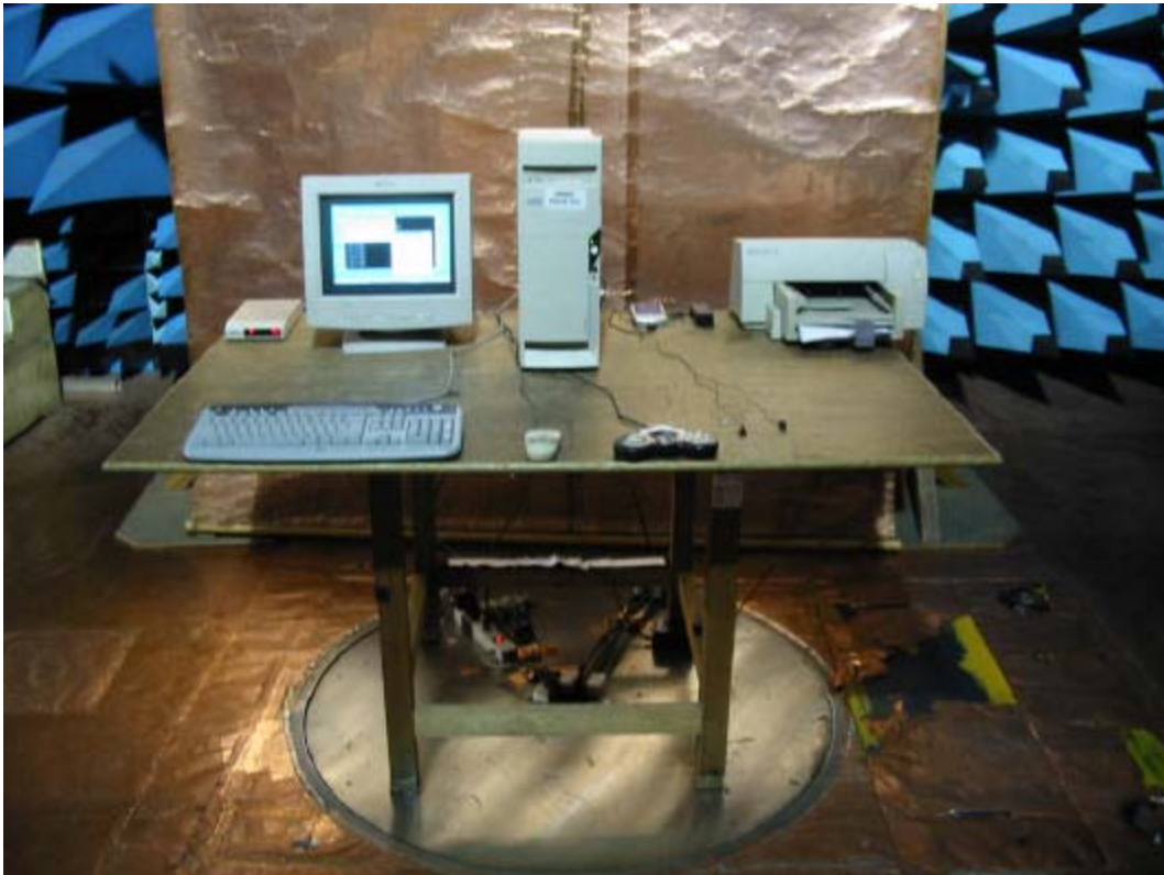
Front View of the Test Configuration