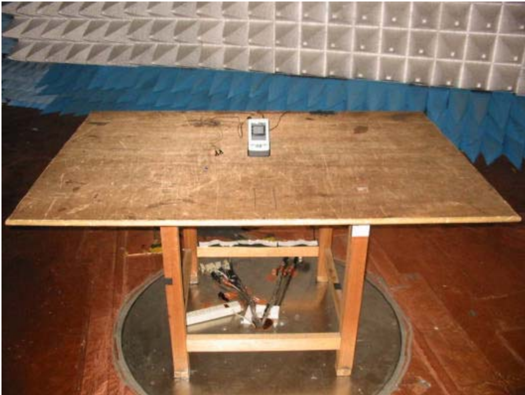
Front View of the Test Configuration of Intentional