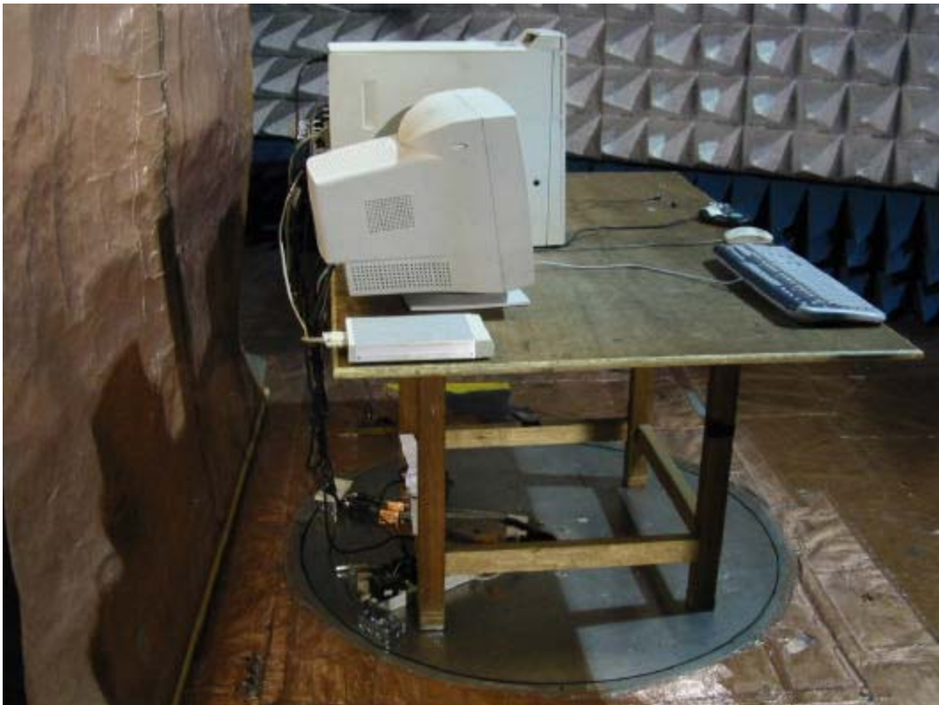
Side View of the Test Configuration