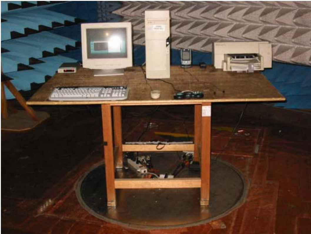
Front View of the Test Configuration of Unintentional