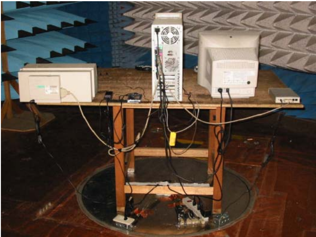
Rear View of the Test Configuration of Unintentional