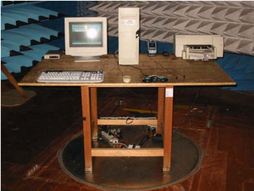
Front View of the Test Configuration of Unintentional