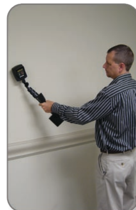
Telescoping antenna pole retracted.

Input AC: 100-240 V, 50-60 Hz Run Time: 4 hours per battery (typical) Charge Time: 2.5 hours per battery Batteries: 10.8V Lithium Ion Rechargeable Battery (2 included)