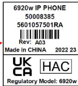
Product label (57009135$A1,25.4*25.4MM)