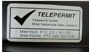
Telepermit LBL (2340-0246-01$A1,31.75*15.875 mm)