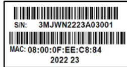
S/N label (2340-0246-01$A1,31.75*16.51MM)