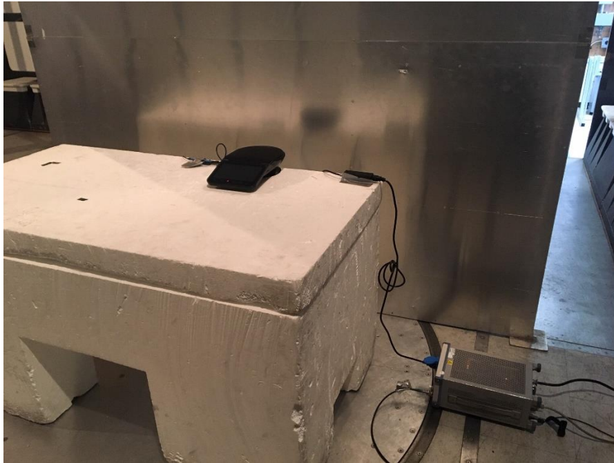
Figure 1.2-1: AC power line conducted emissions – setup photo