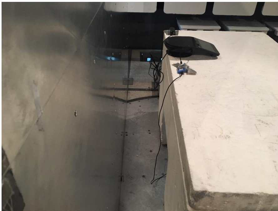
Figure 1.2-2: AC power line conducted emissions – setup photo