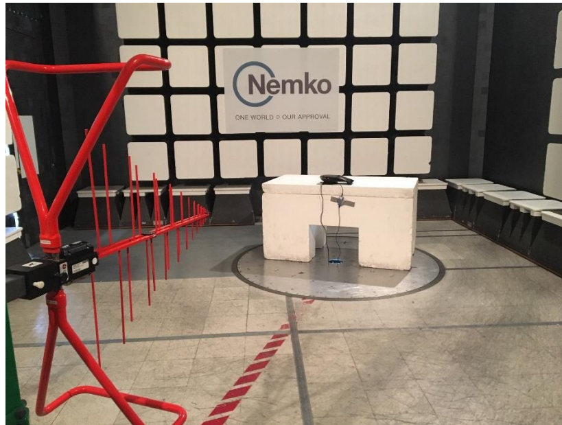
Figure 1.1-1: Radiated emissions setup photo – below 1 GHz