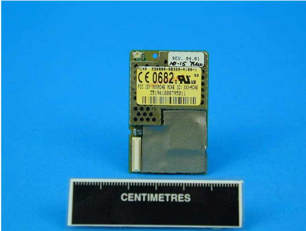
MC-46 GSM/GPRS Module – Top View – without Circuit Board