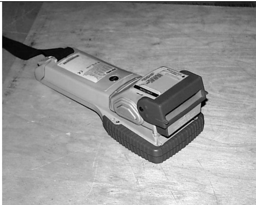
Back view of RT1770