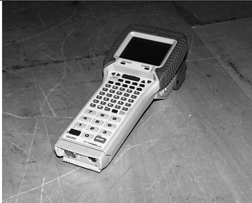
Front view of RT1770