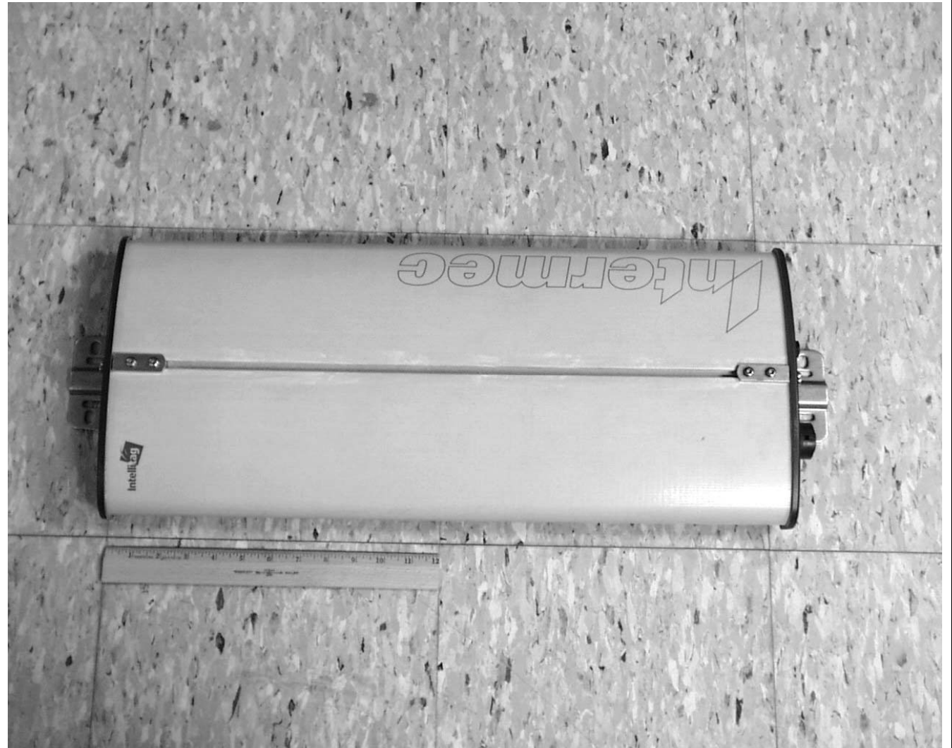
Front view of IV6