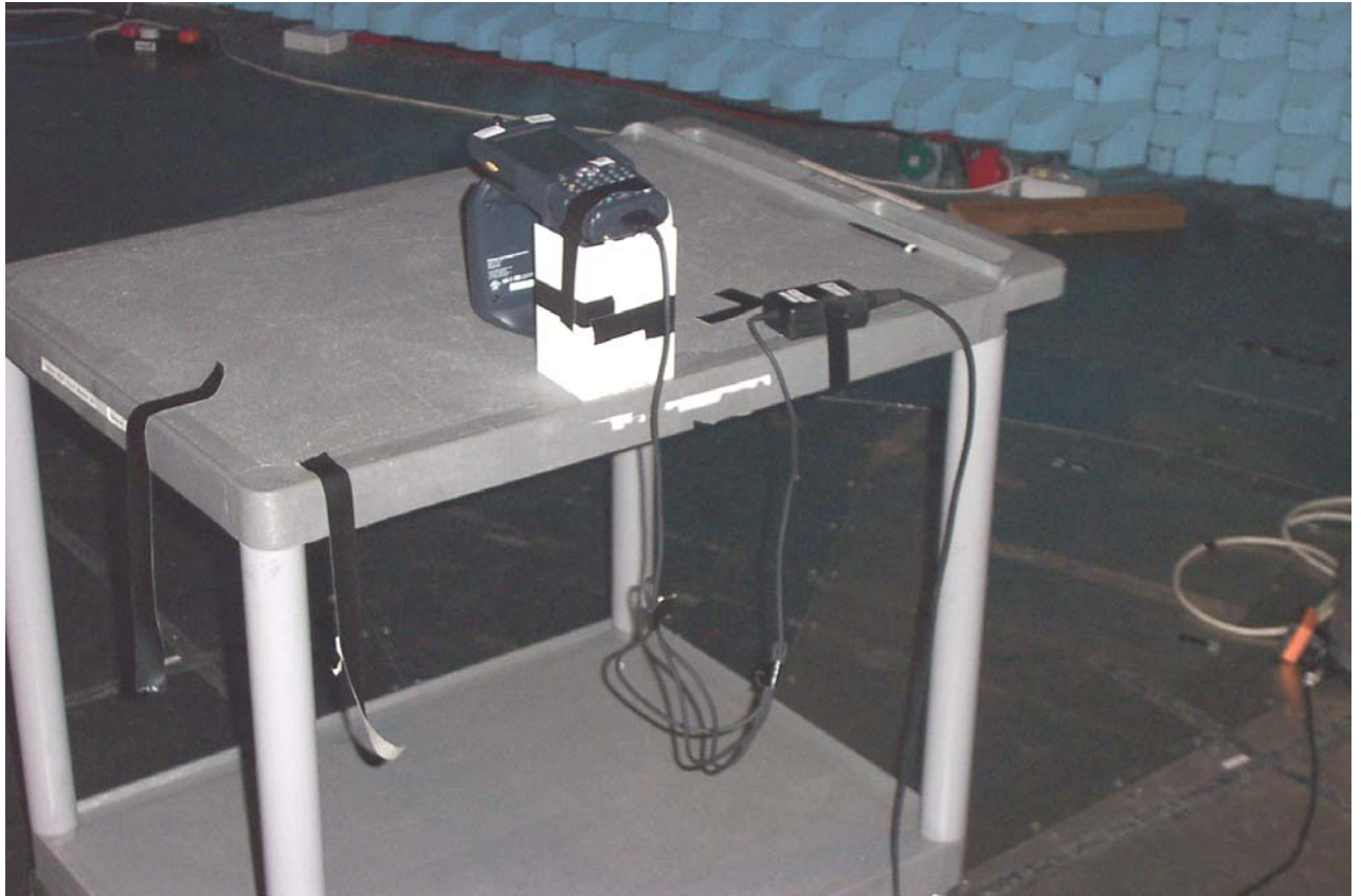
Radiated Emissions Set Up Photograph