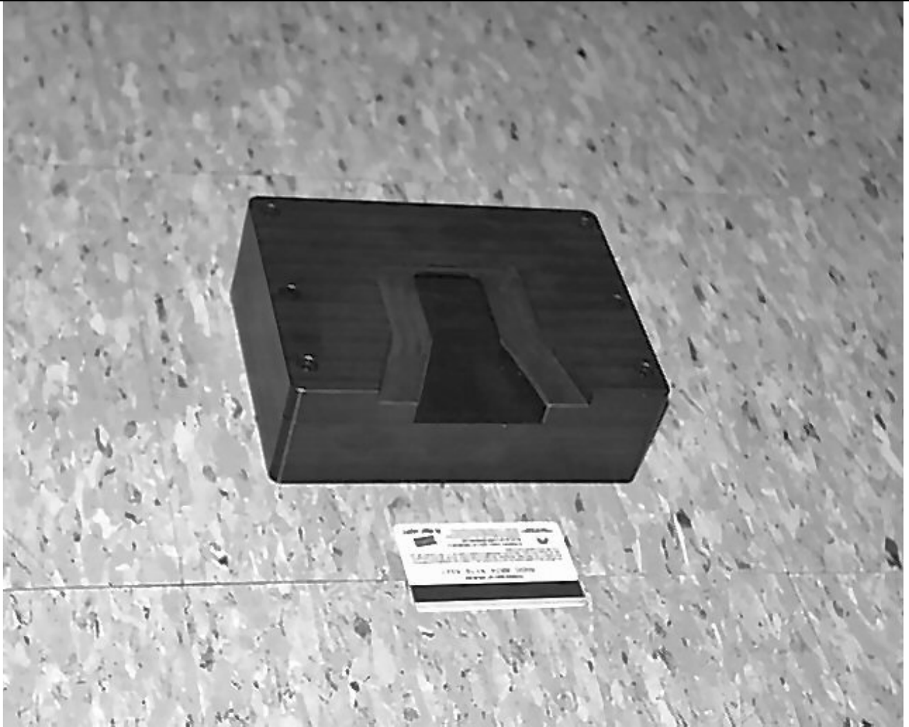
Intermec Card Programming Station PN ITA915017