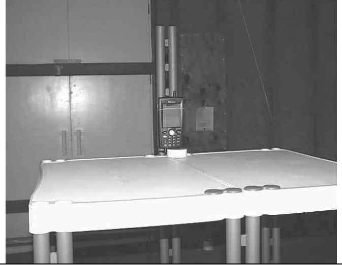
700 unit placed vertically on 3m OATS.