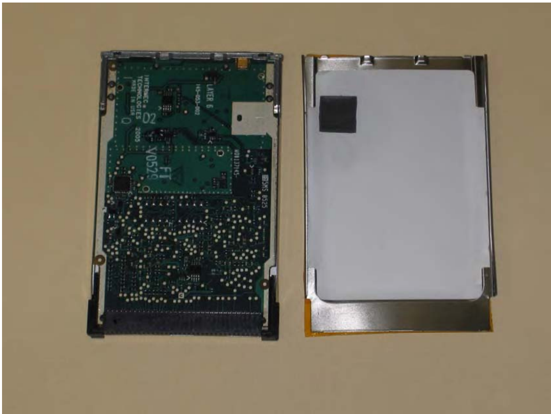
IM4 Card with Bottom Shield Removed