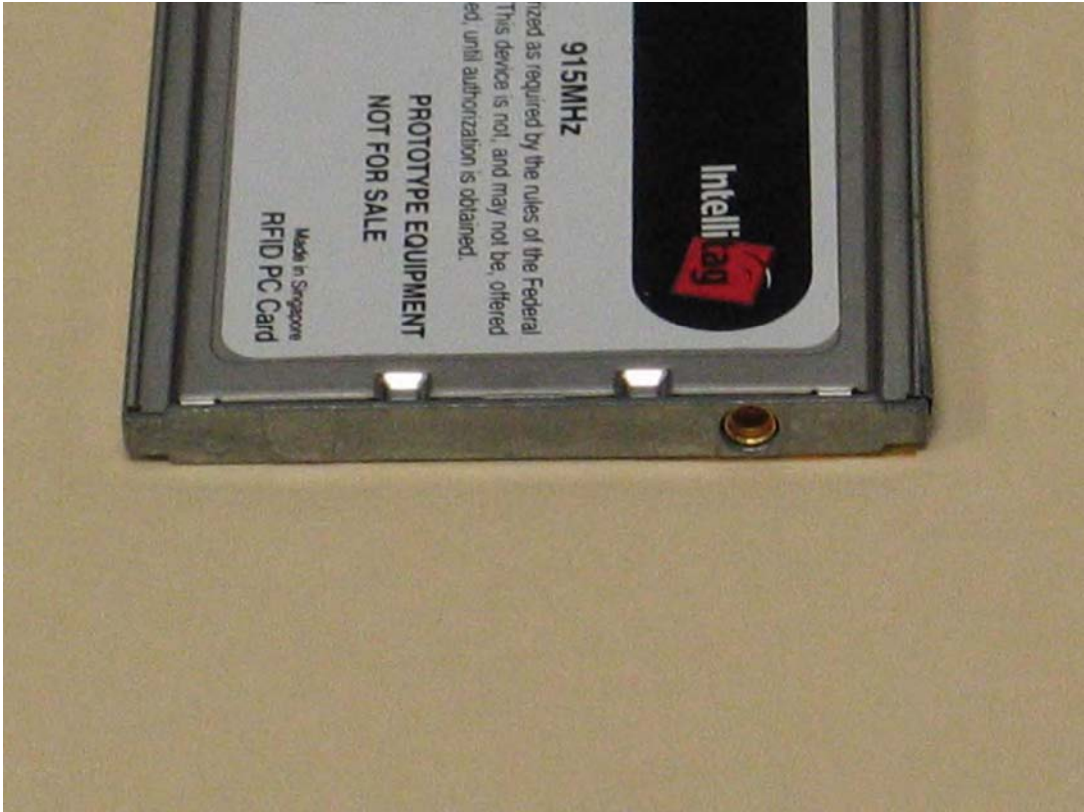
End of IM4 Card with RF Connector