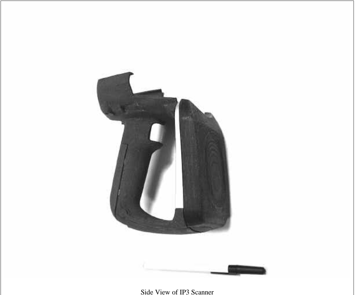
Side View of IP3 Scanner