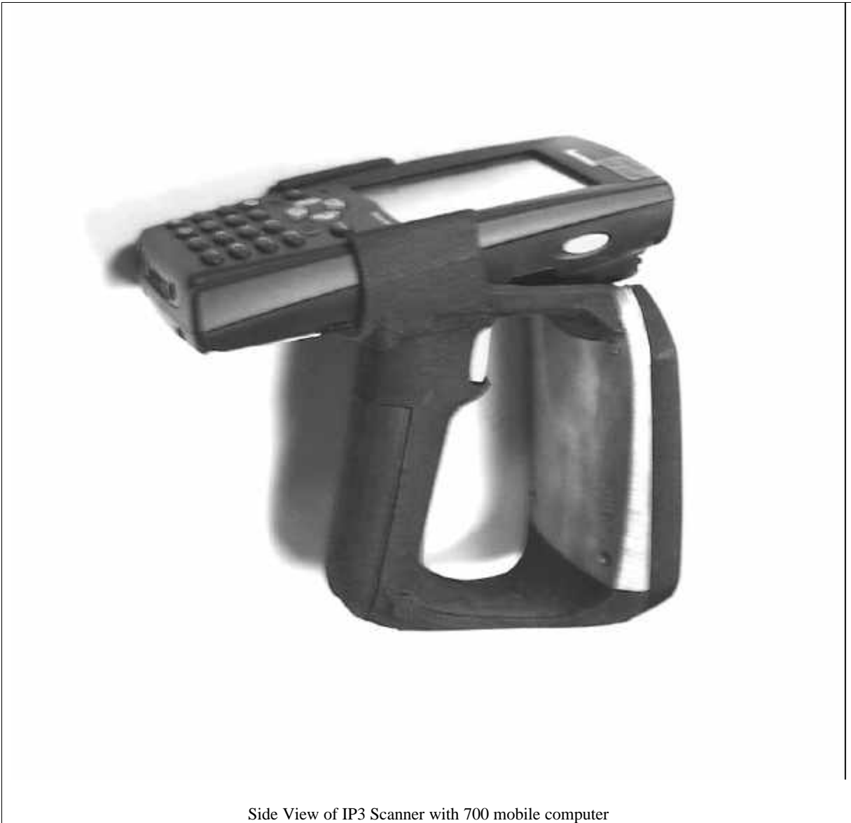
Side View of IP3 Scanner with 700 mobile computer