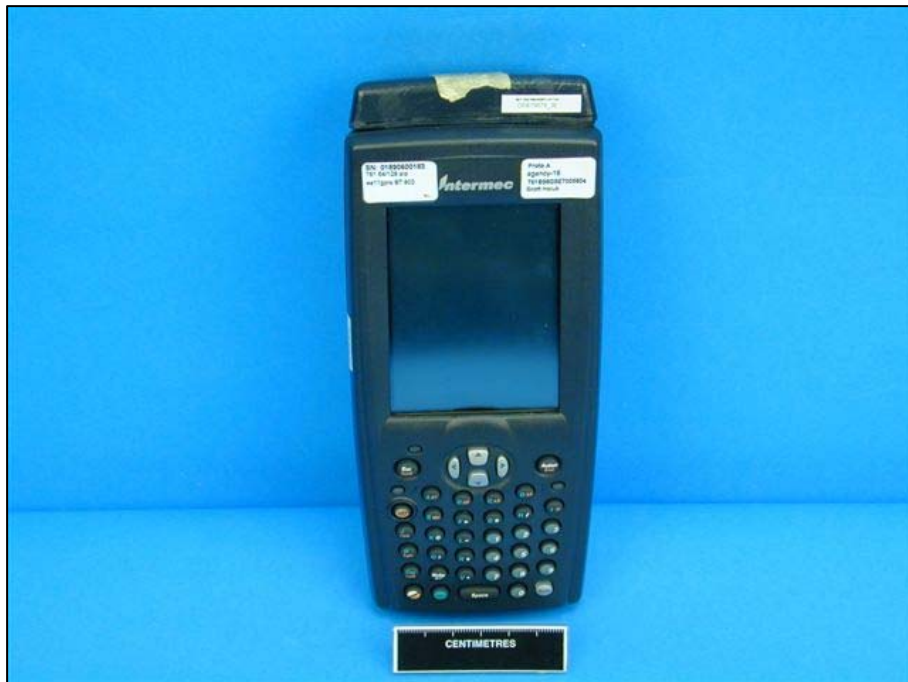
Figure 1: Front View of the Intermec 700C