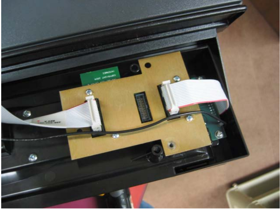
CK60 holder rotated to show PCB mounting