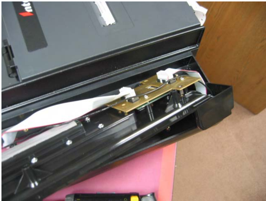
CK60 holder unbolted and partially rotated