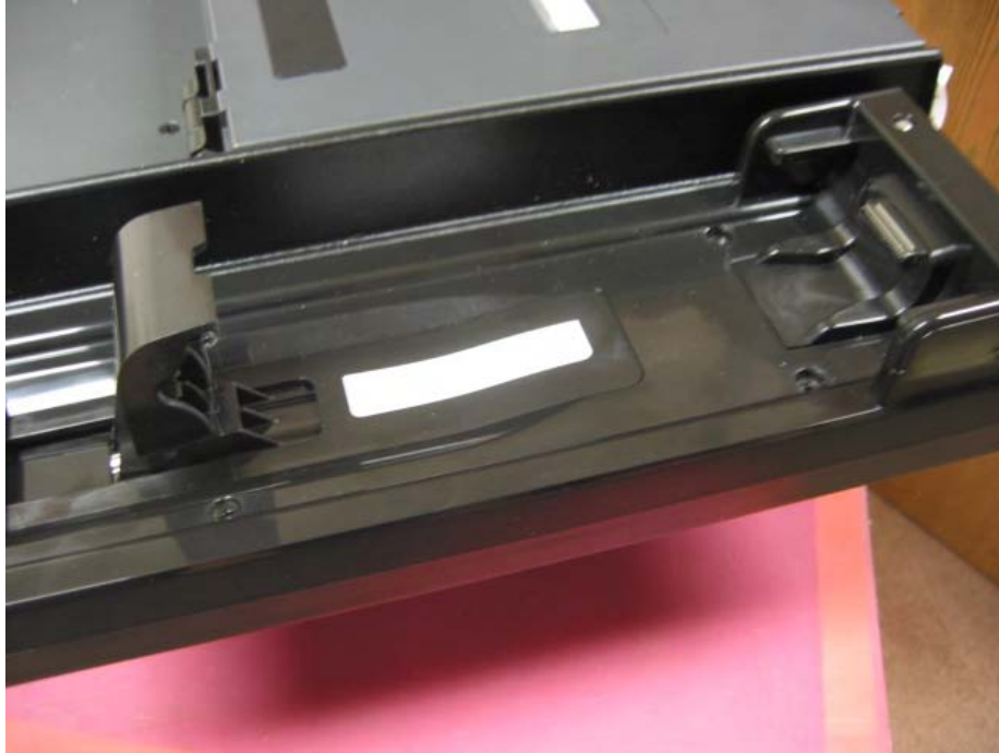
CK60 holder on 6820 printer