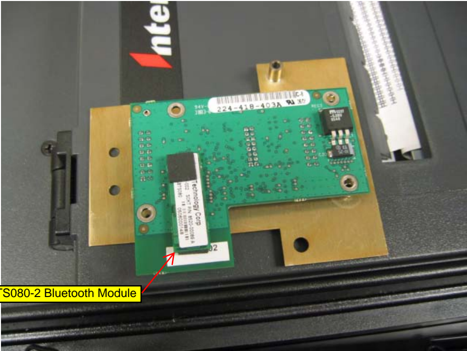
EHABTS080-2 Bluetooth Module