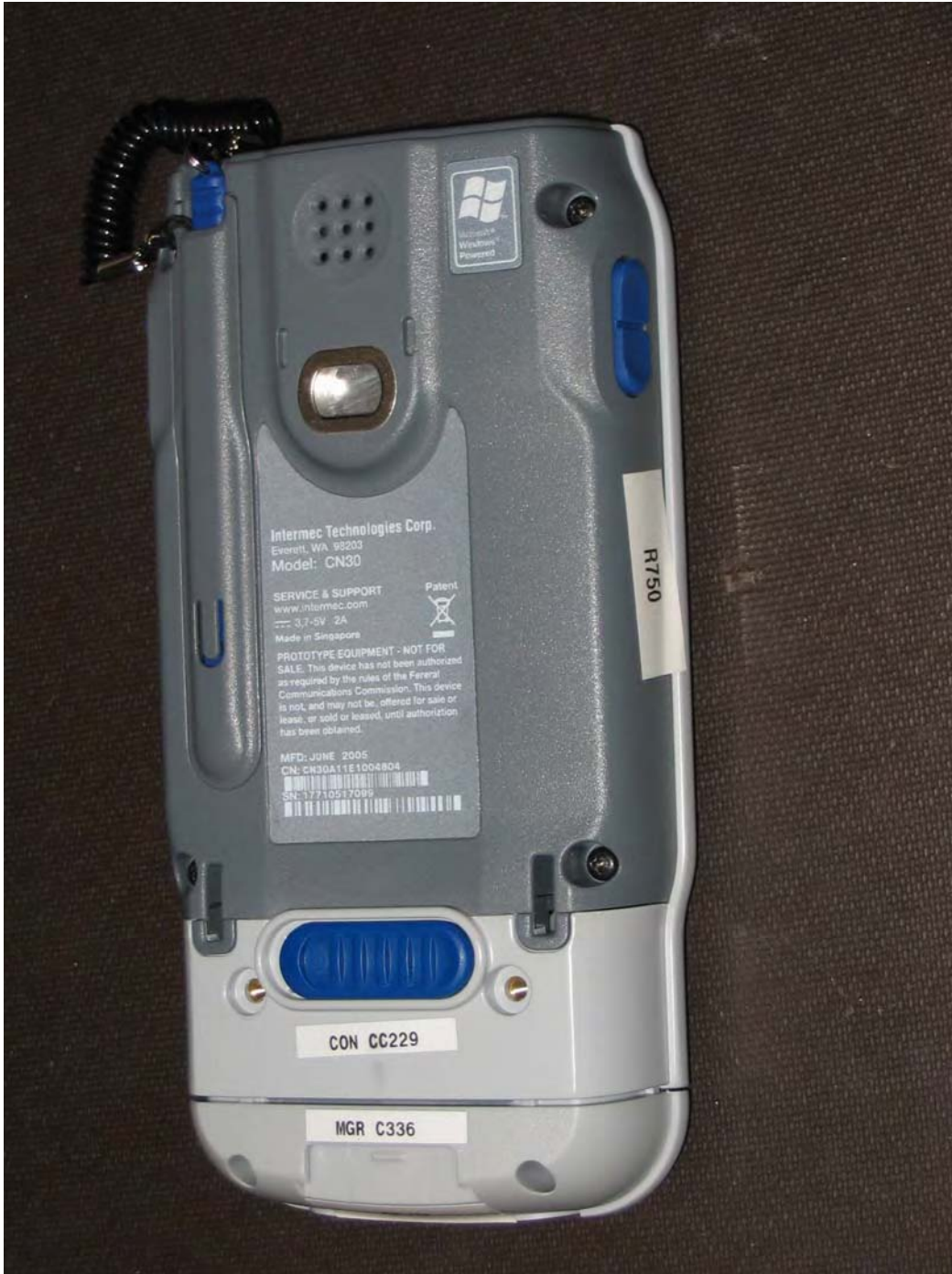
Back of CN30 with 14 key keyboard