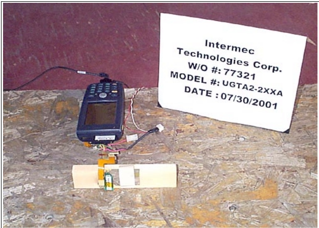
Radiated Emissions - Orthogonal B Front View Close-up