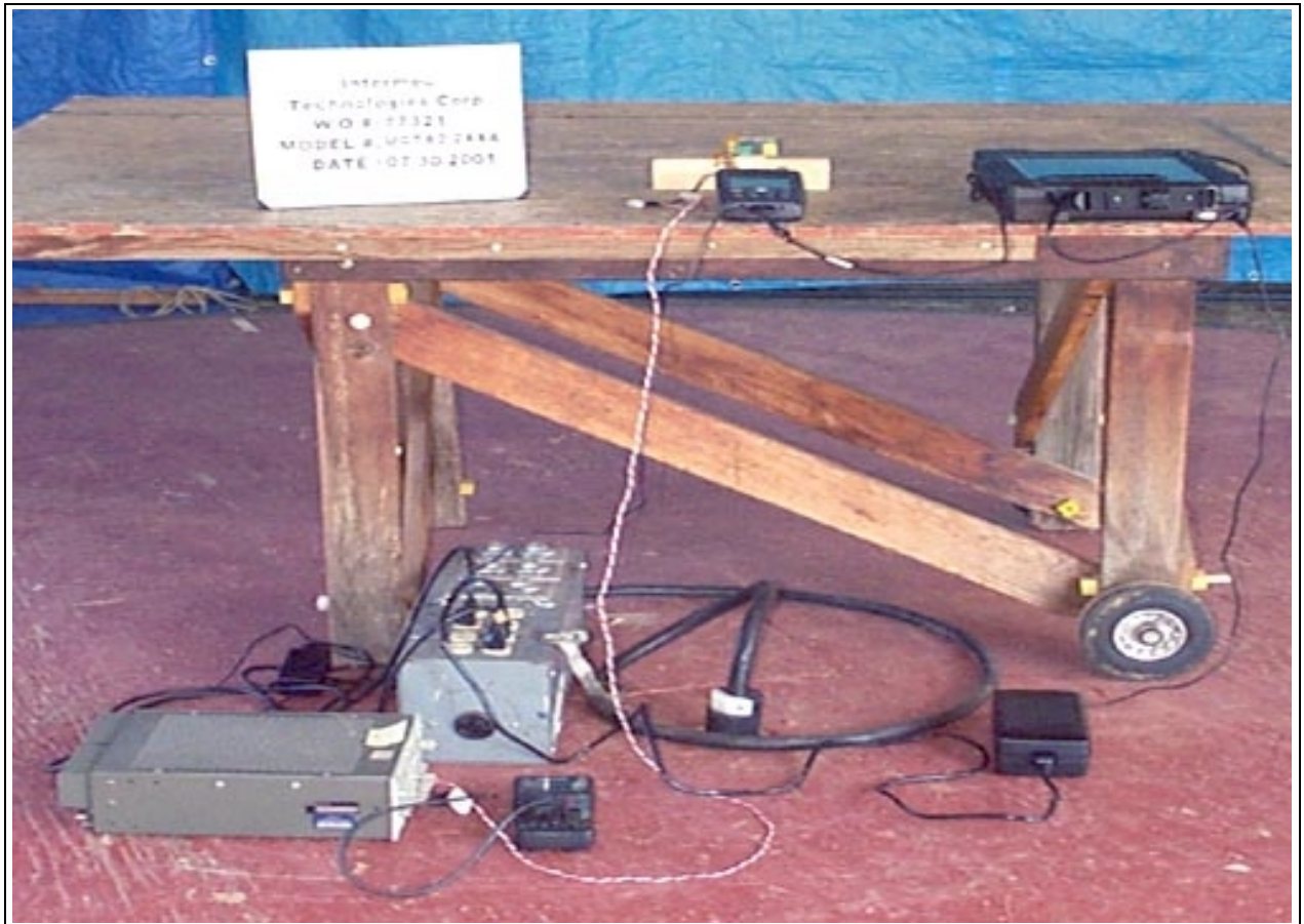
Radiated Emissions - Orthogonal B Back View