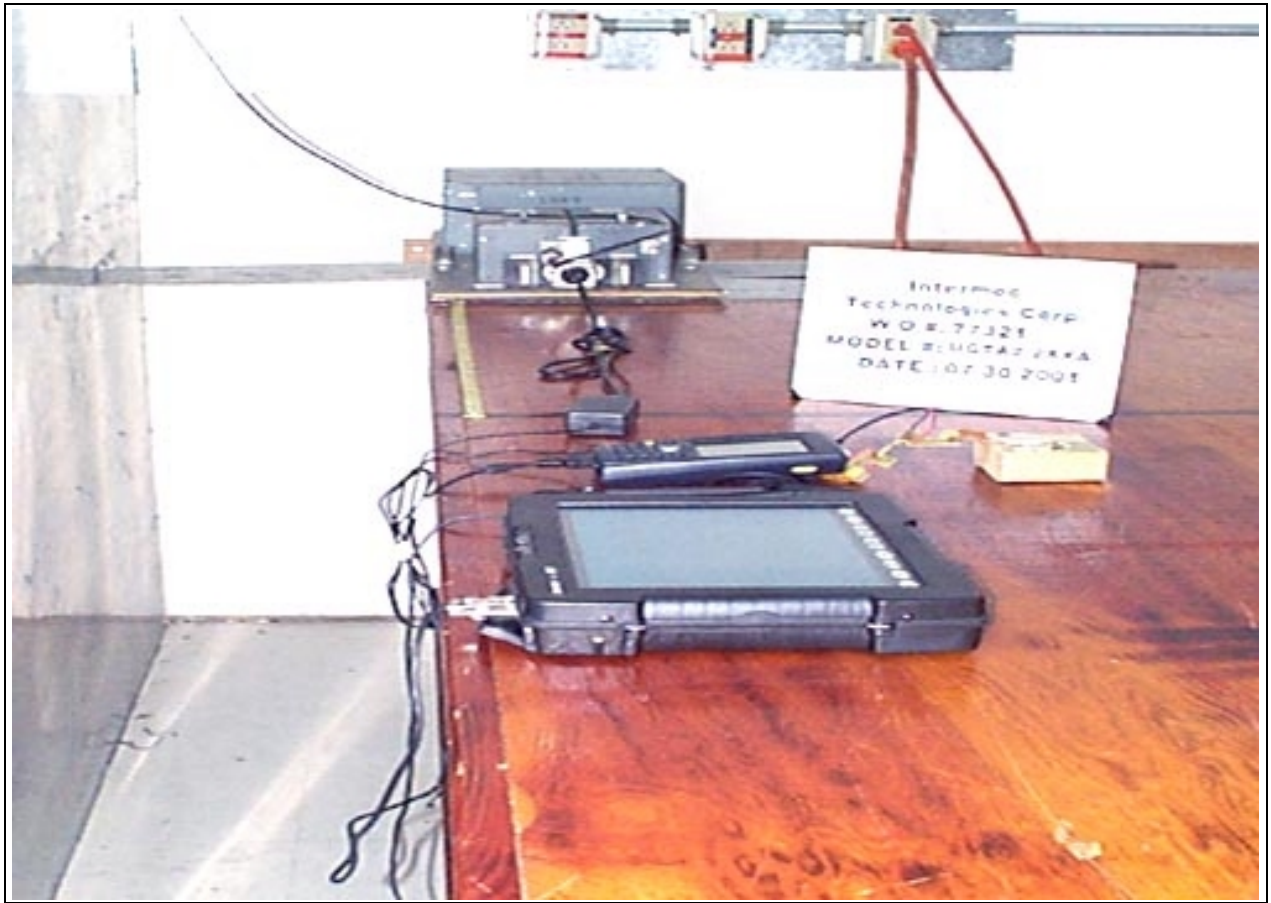
Mains Conducted Emissions - Side View