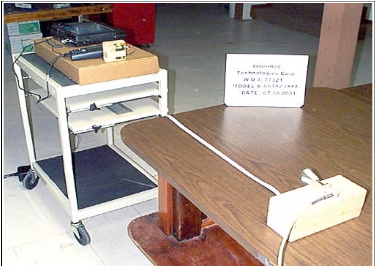
Radiated Emissions - 26GHz