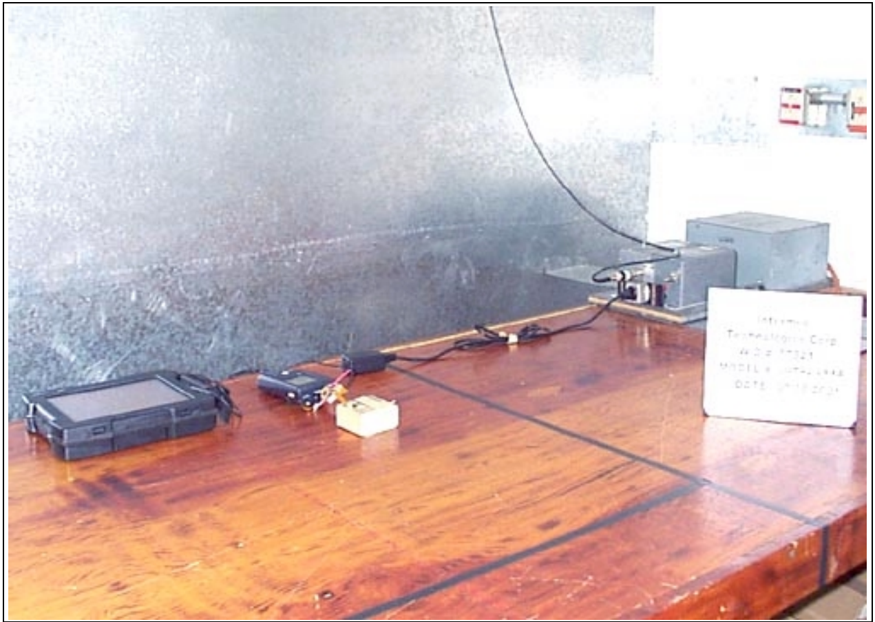
Mains Conducted Emissions - Front View