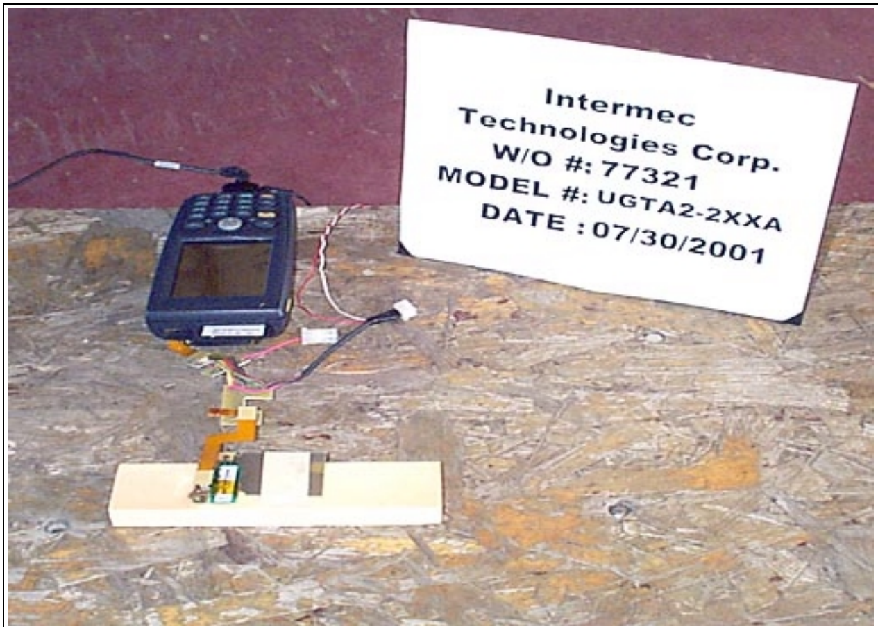
Radiated Emissions - Orthogonal A Close-up