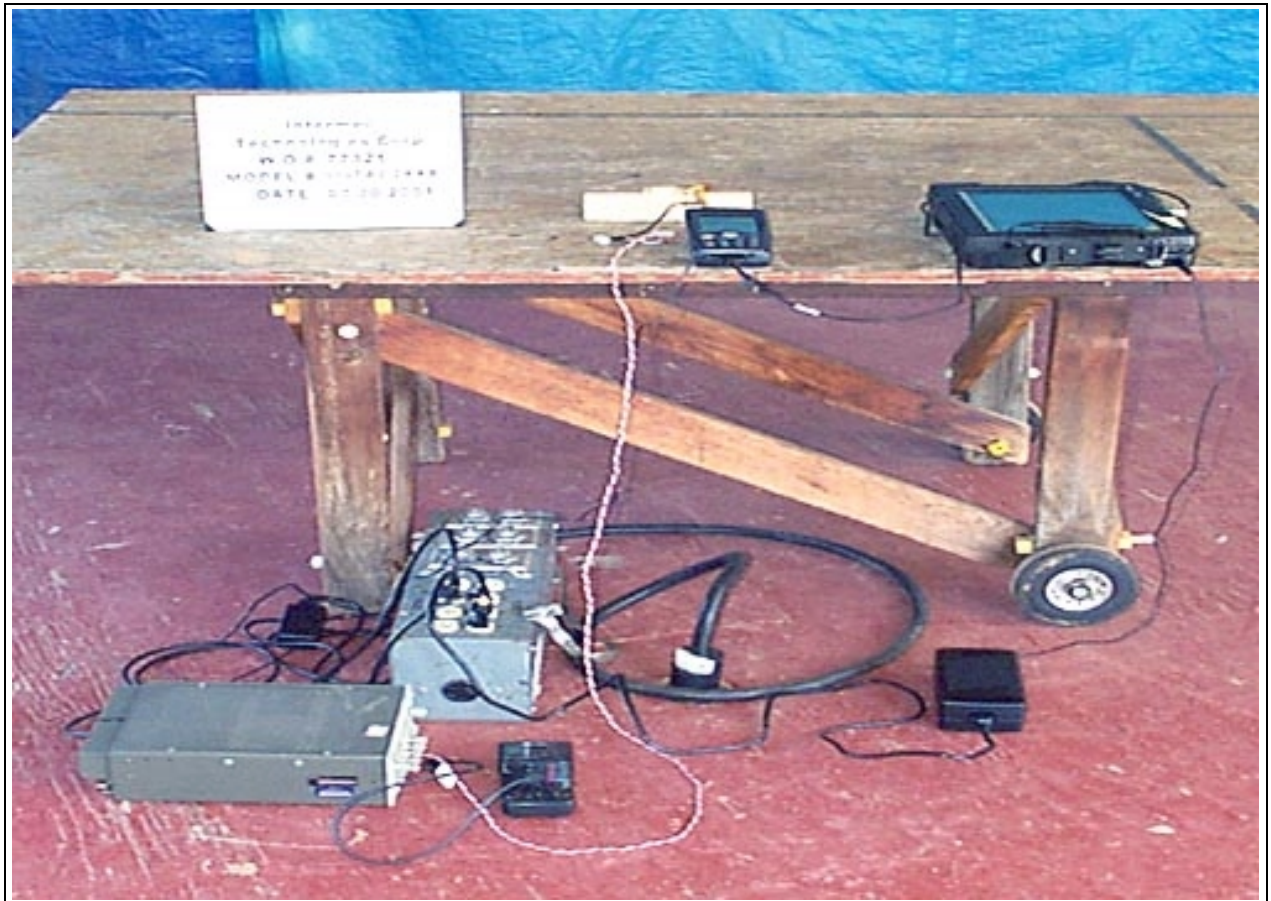
Radiated Emissions - Orthogonal B Back View