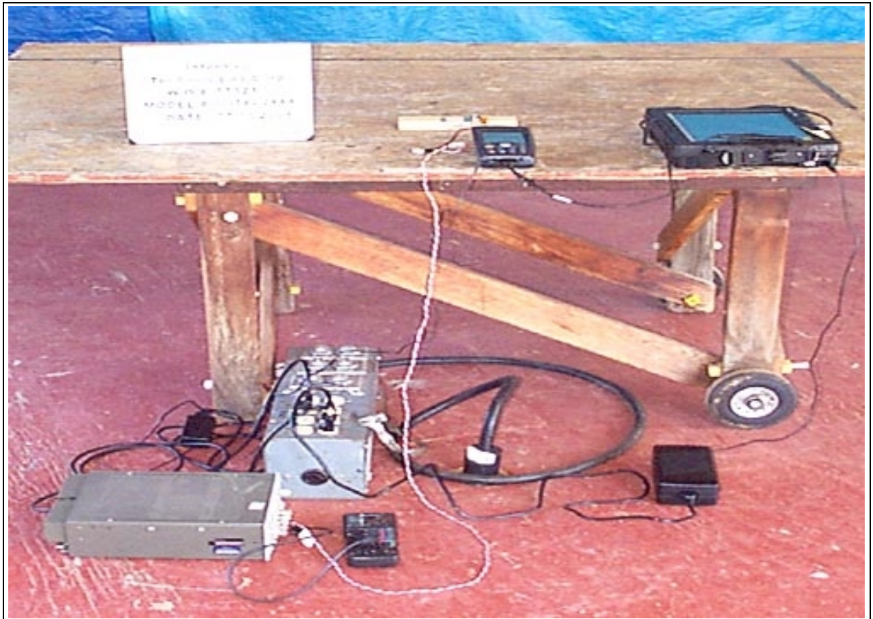
Radiated Emissions - Orthogonal A Back View