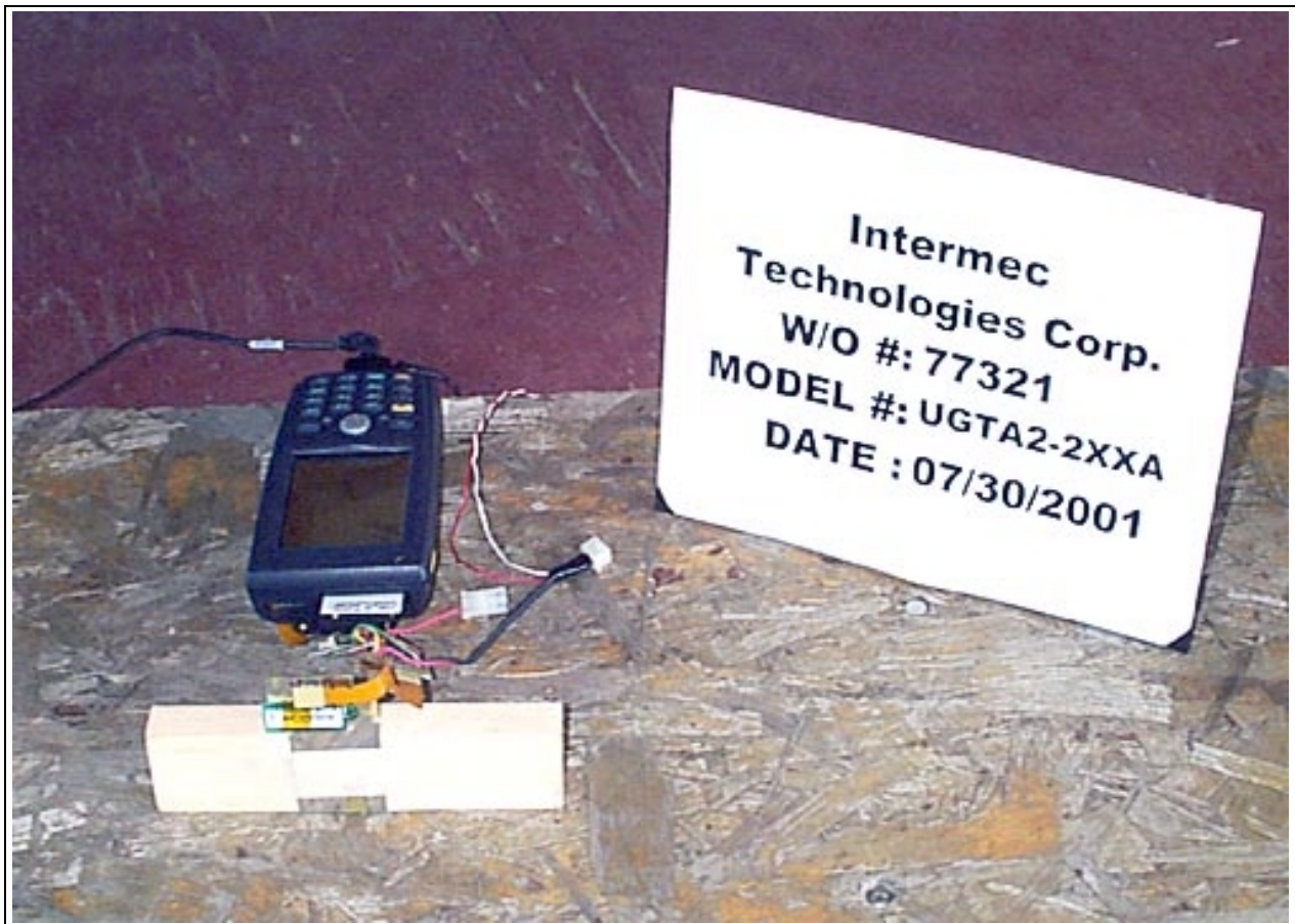
Radiated Emissions - Orthogonal C Front View Close up