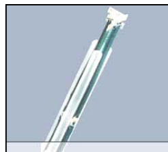
Interior of probe