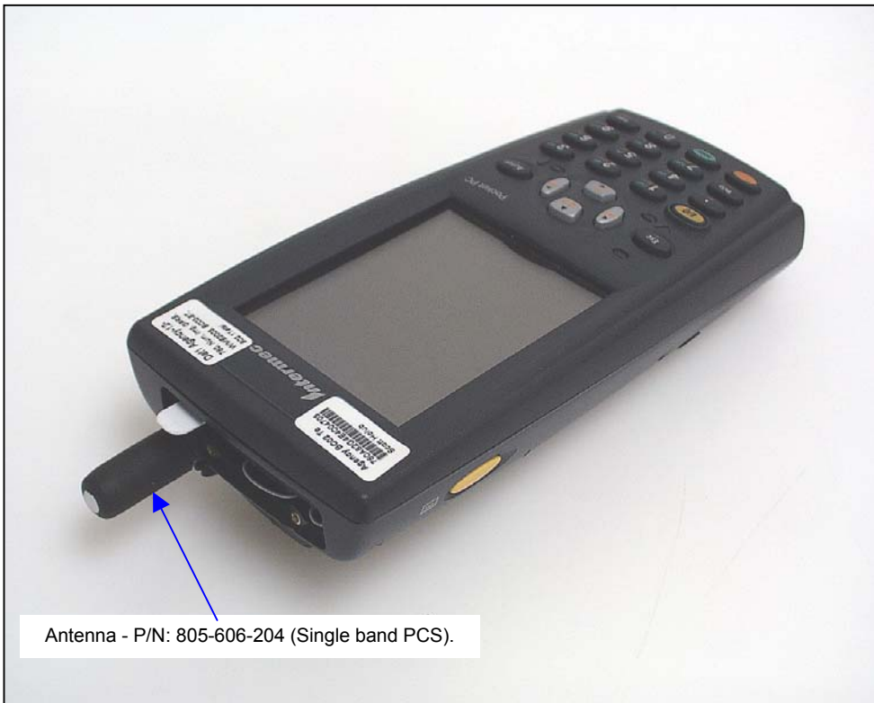
Antenna - P/N: 805-606-204 (Single band PCS).