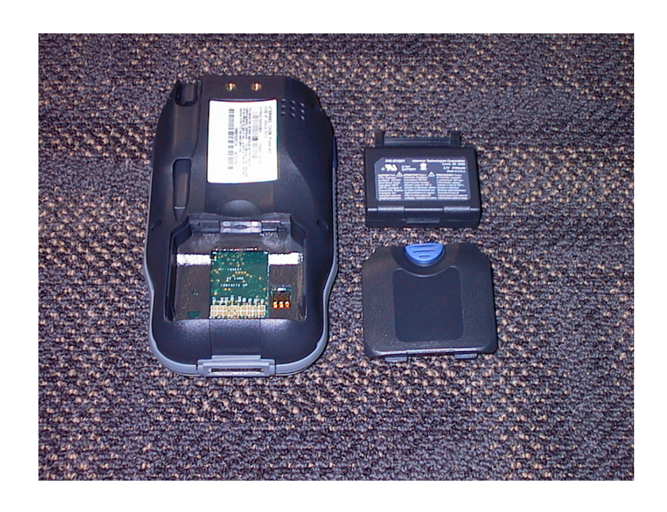
Back of CN2B with Battery Removed