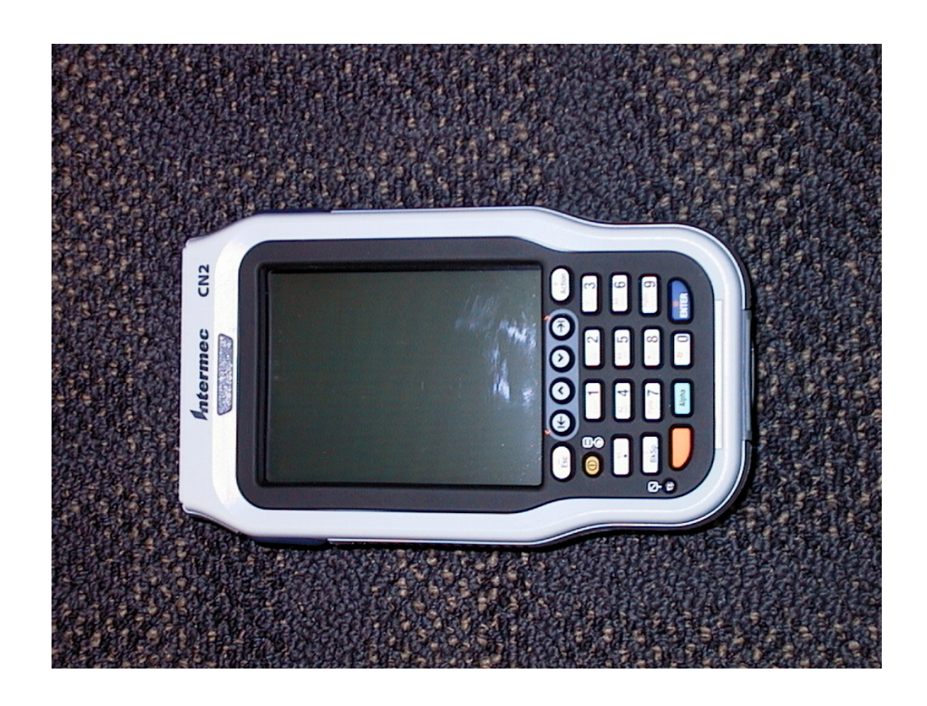
Front of CN2B Unit