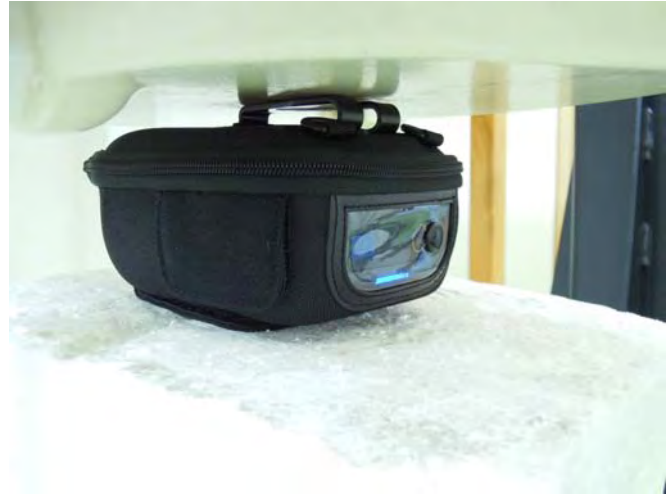
Rear Face of DUT with 0 cm Gap Mobile Receipt Printer Model: PR3 (Belt Clip: Plastic; with holster)