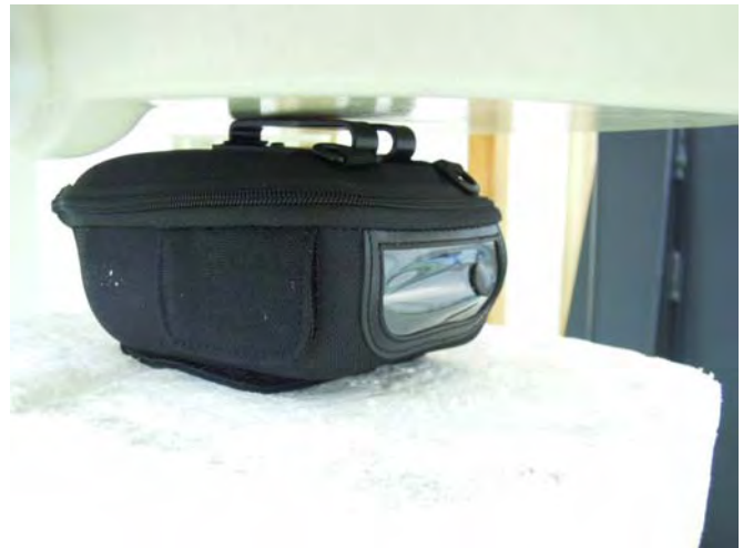
Rear Face of DUT with 0 cm Gap Mobile Receipt Printer Model: PR3 (Belt Clip: Metal; with holster)