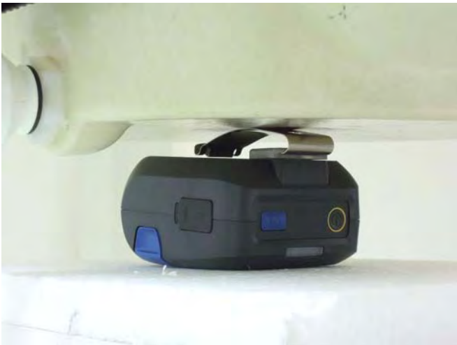
Rear Face of DUT with 0 cm Gap Mobile Receipt Printer Model: PR3 (Belt Clip: Metal; without holster)