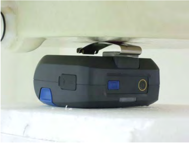
Rear Face of DUT with 0 cm Gap Mobile Receipt Printer Model: PR2 (Belt Clip: Metal; without holster)