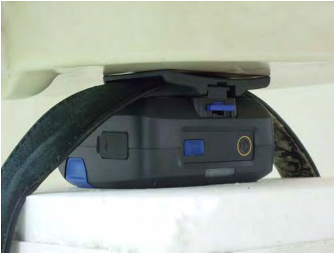
Rear Face of DUT with 0 cm Gap Mobile Receipt Printer Model: PR2 (Belt Loop: Plastic; without holster)