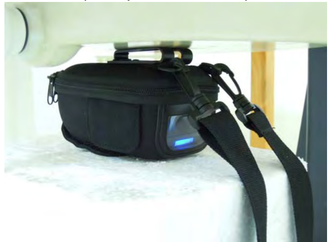
Rear Face of DUT with 0 cm Gap Mobile Receipt Printer Model: PR2 (Belt Clip: Plastic; with holster)