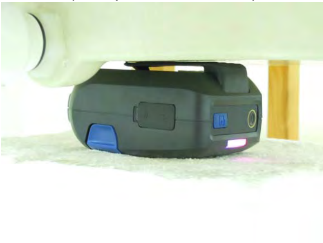
Rear Face of DUT with 0 cm Gap Mobile Receipt Printer Model: PR2 (Belt Clip: Plastic; without holster)