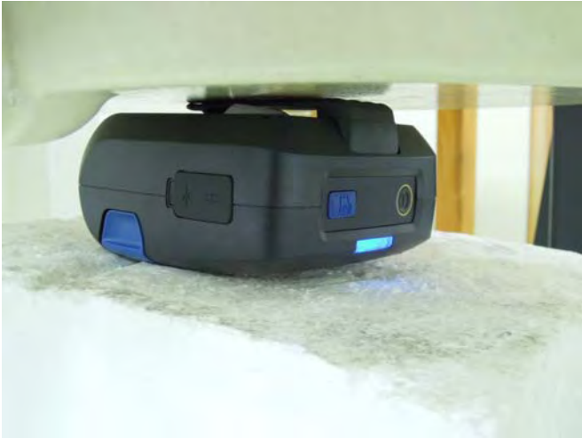
Rear Face of DUT with 0 cm Gap Mobile Receipt Printer Model: PR3 (Belt Clip: Plastic; without holster)