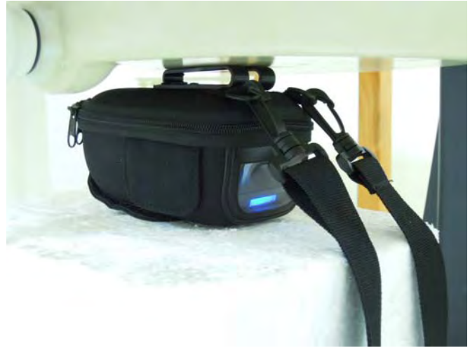
Rear Face of DUT with 0 cm Gap Mobile Receipt Printer Model: PR2 (Belt Clip: Metal; with holster)