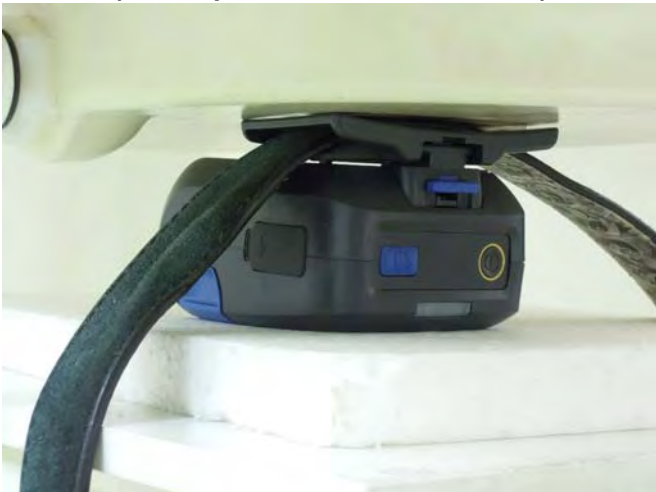
Rear Face of DUT with 0 cm Gap Mobile Receipt Printer Model: PR3 (Belt Loop: Plastic; without holster)