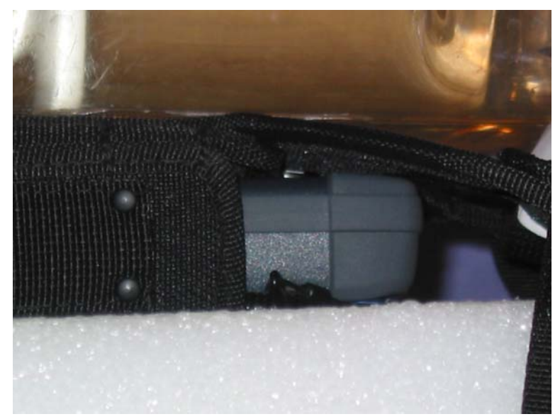
Test Position – Body Front