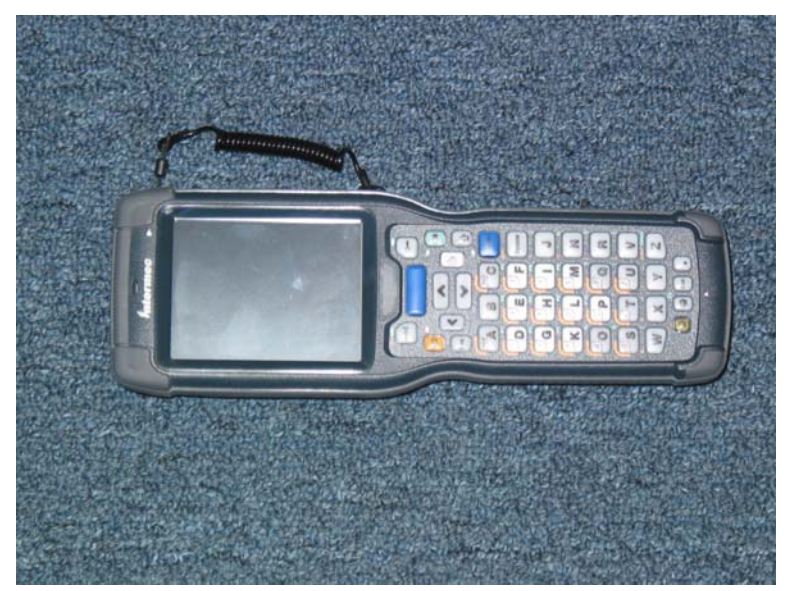
Front of Device