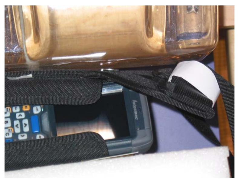
Test Position – Body Left