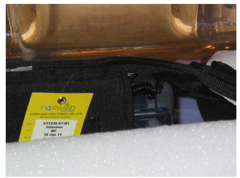
Test Position – Body Right