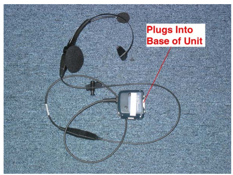
Headset for Testing