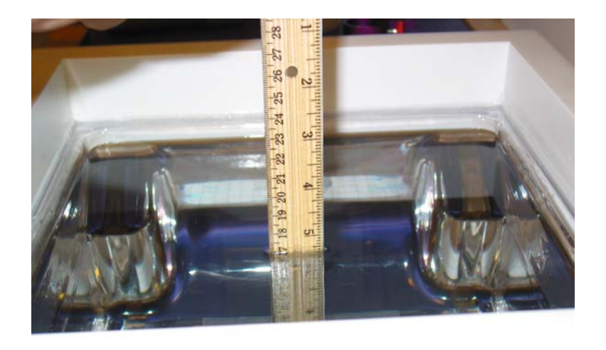
Body Tissue Depth