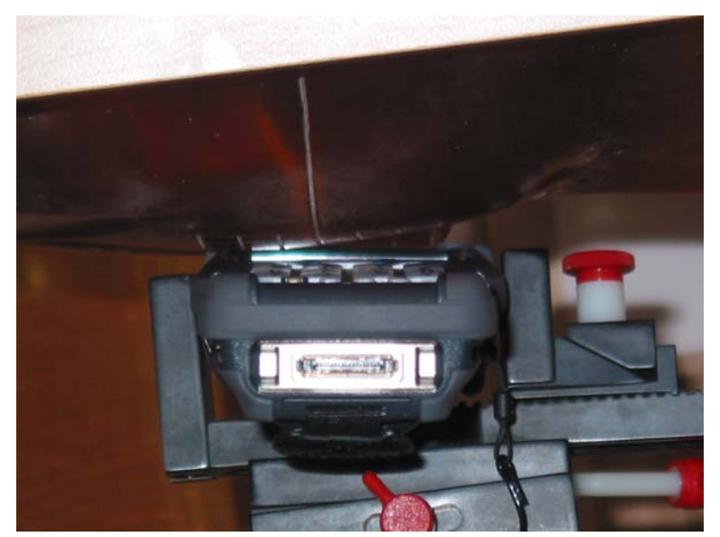
Test Position - Right Head Touch