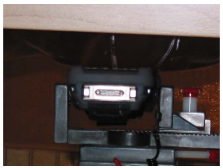
Test Position - Left Head Touch