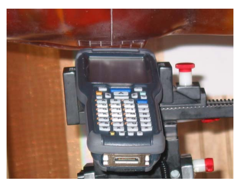
Test Position – Right Head Tilt