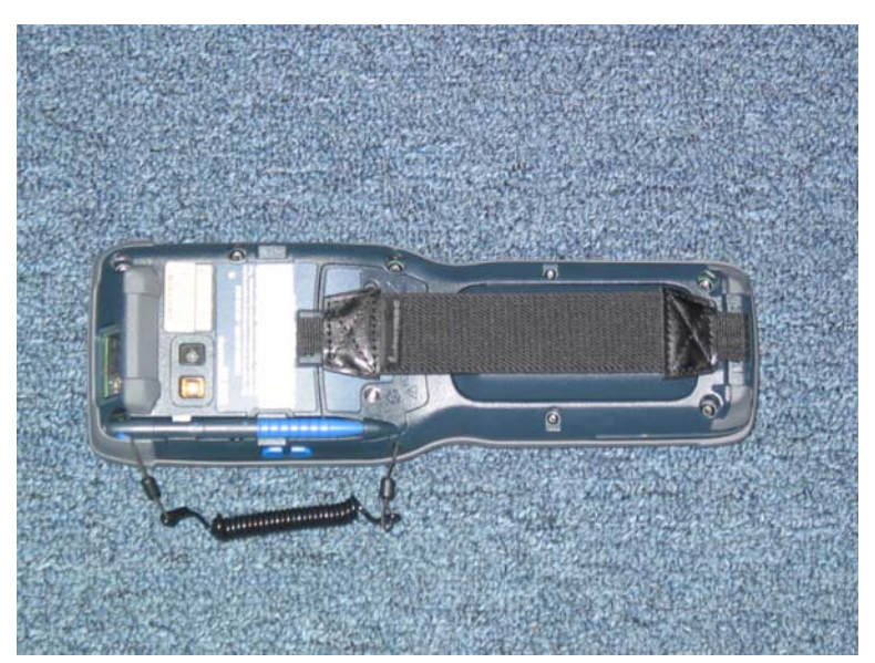
Back of Device