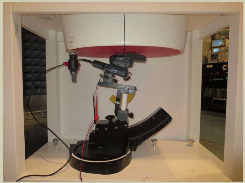
1000CP02C with IP30C (cut handle)