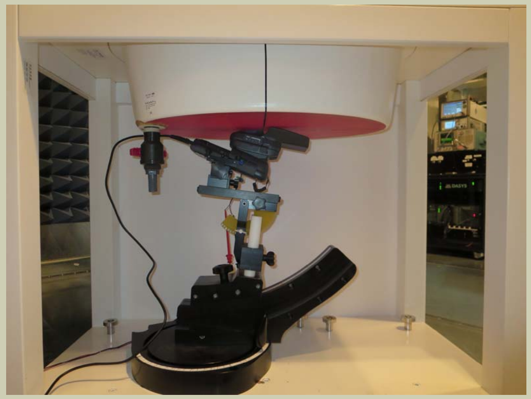
1000CP01U with IP30C (cut handle)