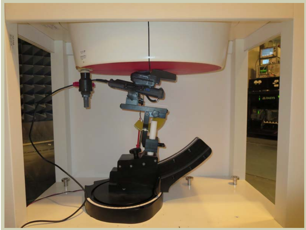
1001CP01S with IP30C (cut handle)