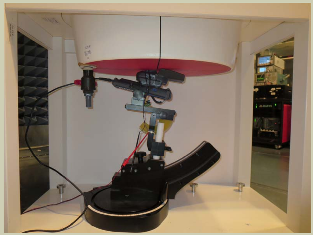
1001CP01U with IP30C (cut handle)