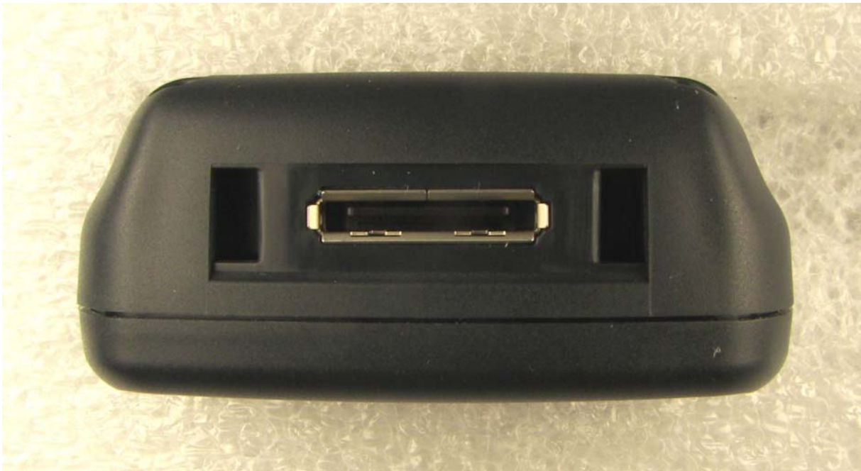
Bottom, connects to dock