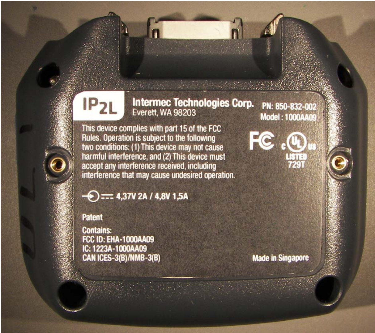
Back, standard unit