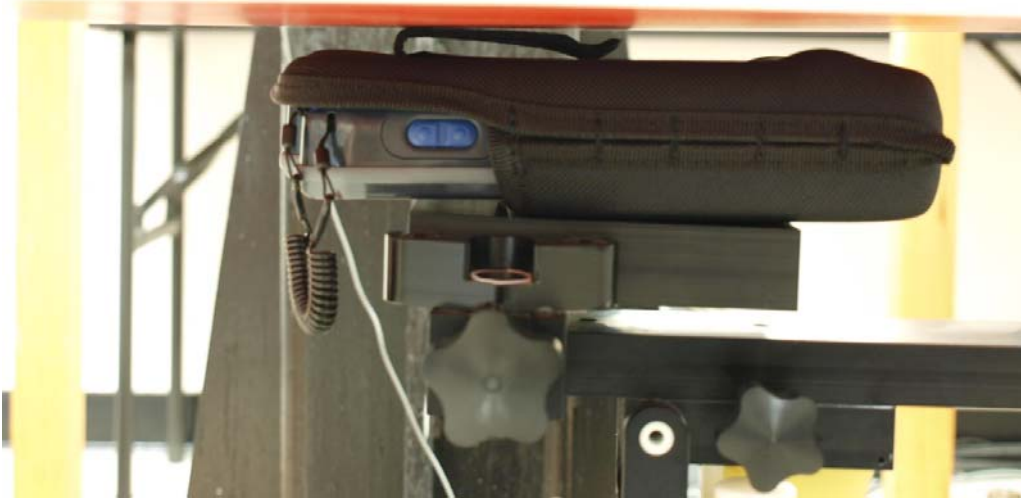
BODY – LCD UP w/ 2 cm Separation