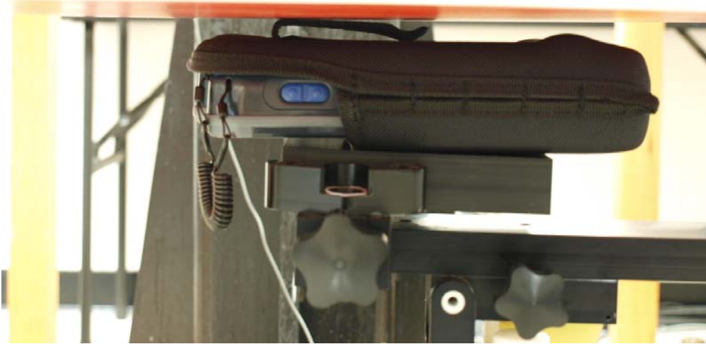
BODY – LCD UP w/ holster and belt clip