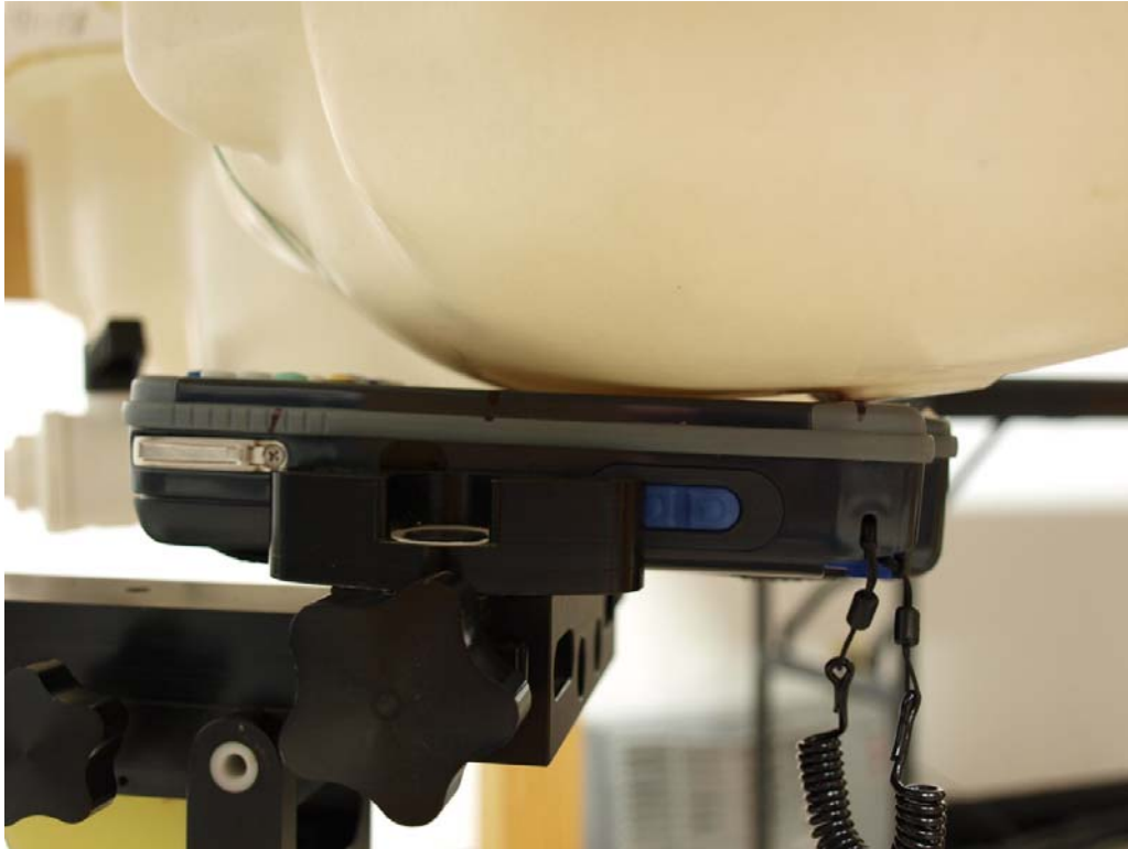
LEFT HAND SIDE TTILT (15°)