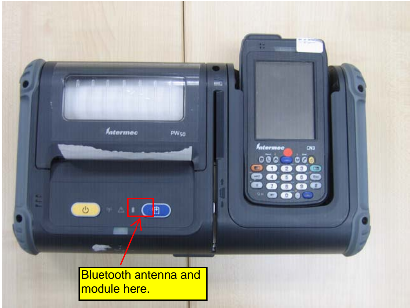
Pw50 with Cn3e