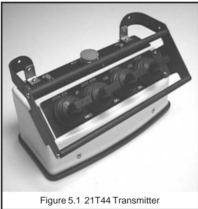
Figure 5.1 21T44 Transmitter

The crane control transmitters are designed to be very efficient. Only three AA batteries are needed to provide power for the transmitter for two month's normal use. Up to 9 batteries may be used to extend the operating time much longer. An additional feature automatically shuts the transmitter off after a preset time interval of inactivity to further extend the battery life.