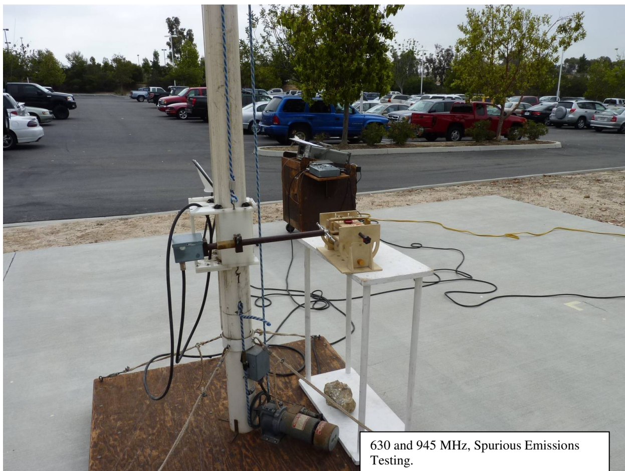
630 and 945 MHz, Spurious Emissions Testing.