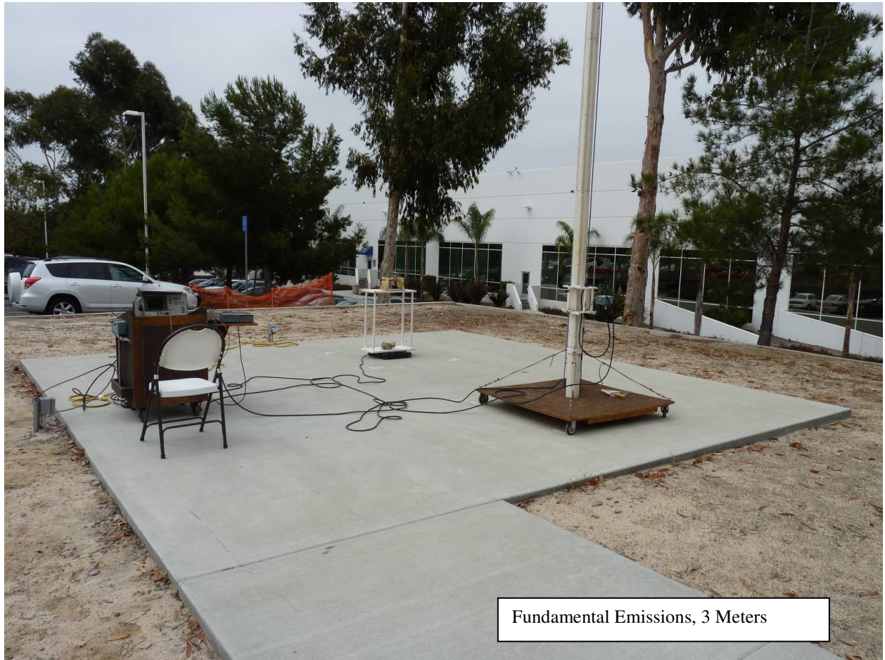
Fundamental Emissions, 3 Meters