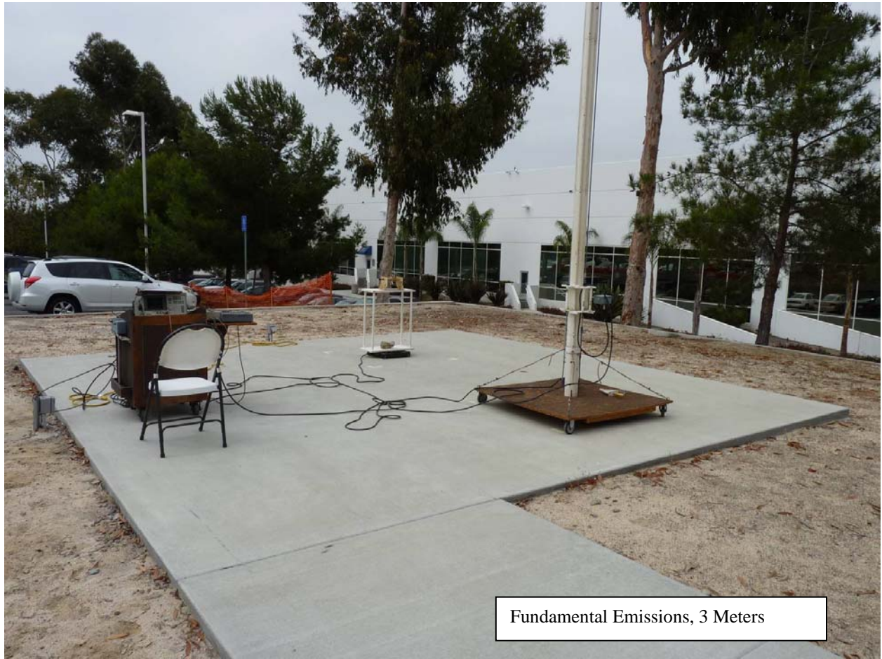
Fundamental Emissions, 3 Meters