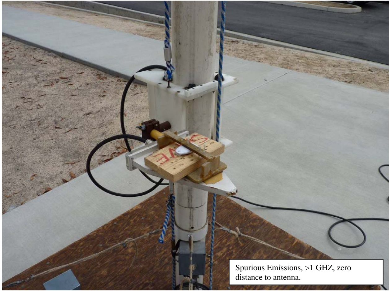
Spurious Emissions, >1 GHZ, zero distance to antenna.