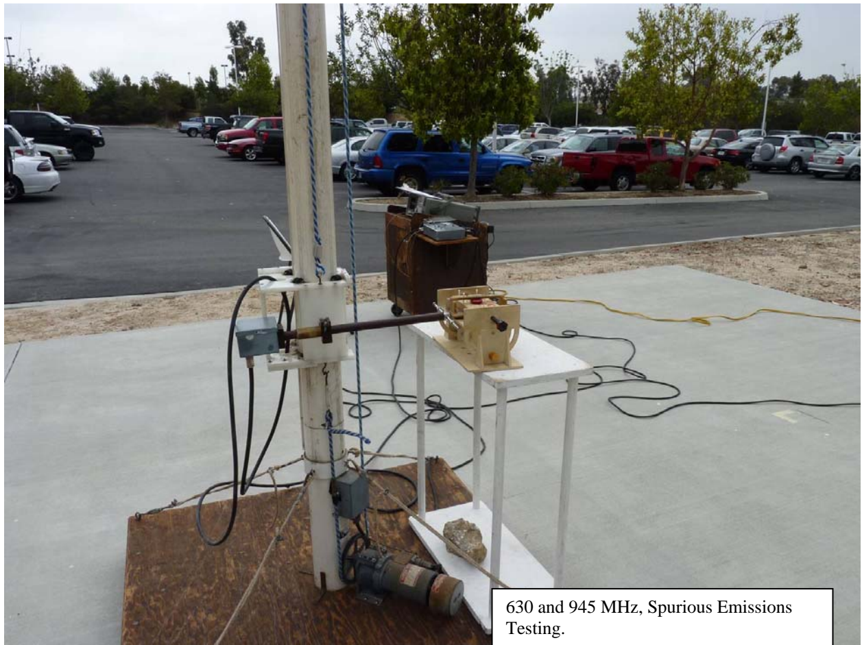
630 and 945 MHz, Spurious Emissions Testing.