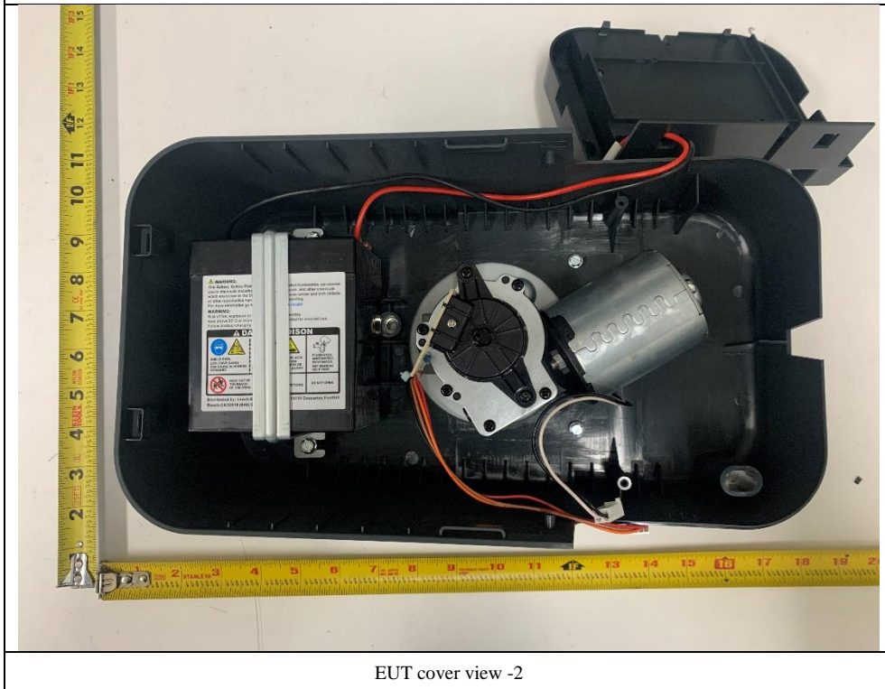
EUT cover view -2