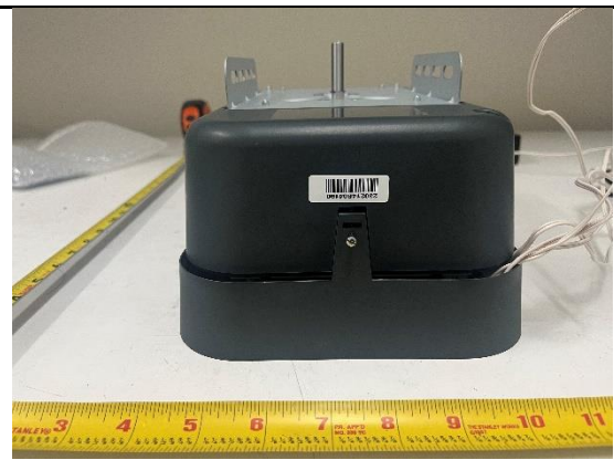
EUT Rear View