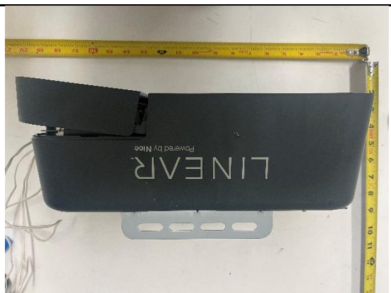
EUT Left View