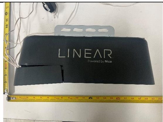
EUT Right View