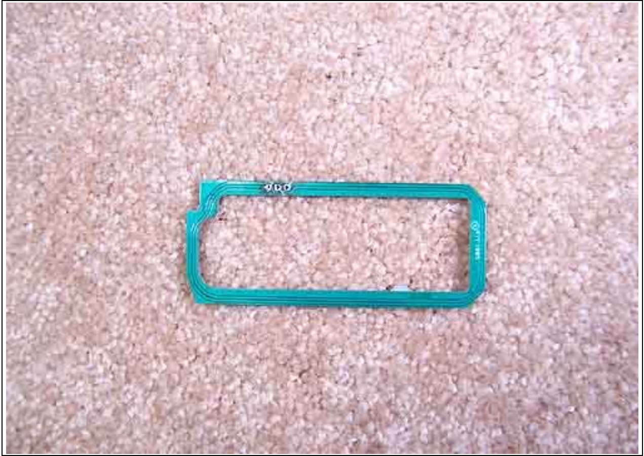
Antenna PCB Front