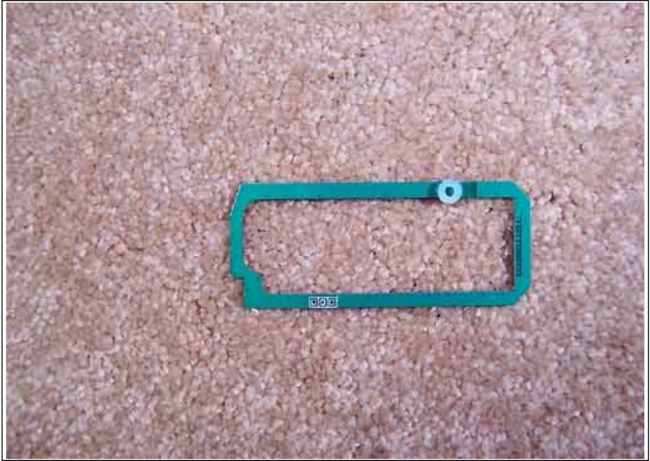
Antenna PCB Back