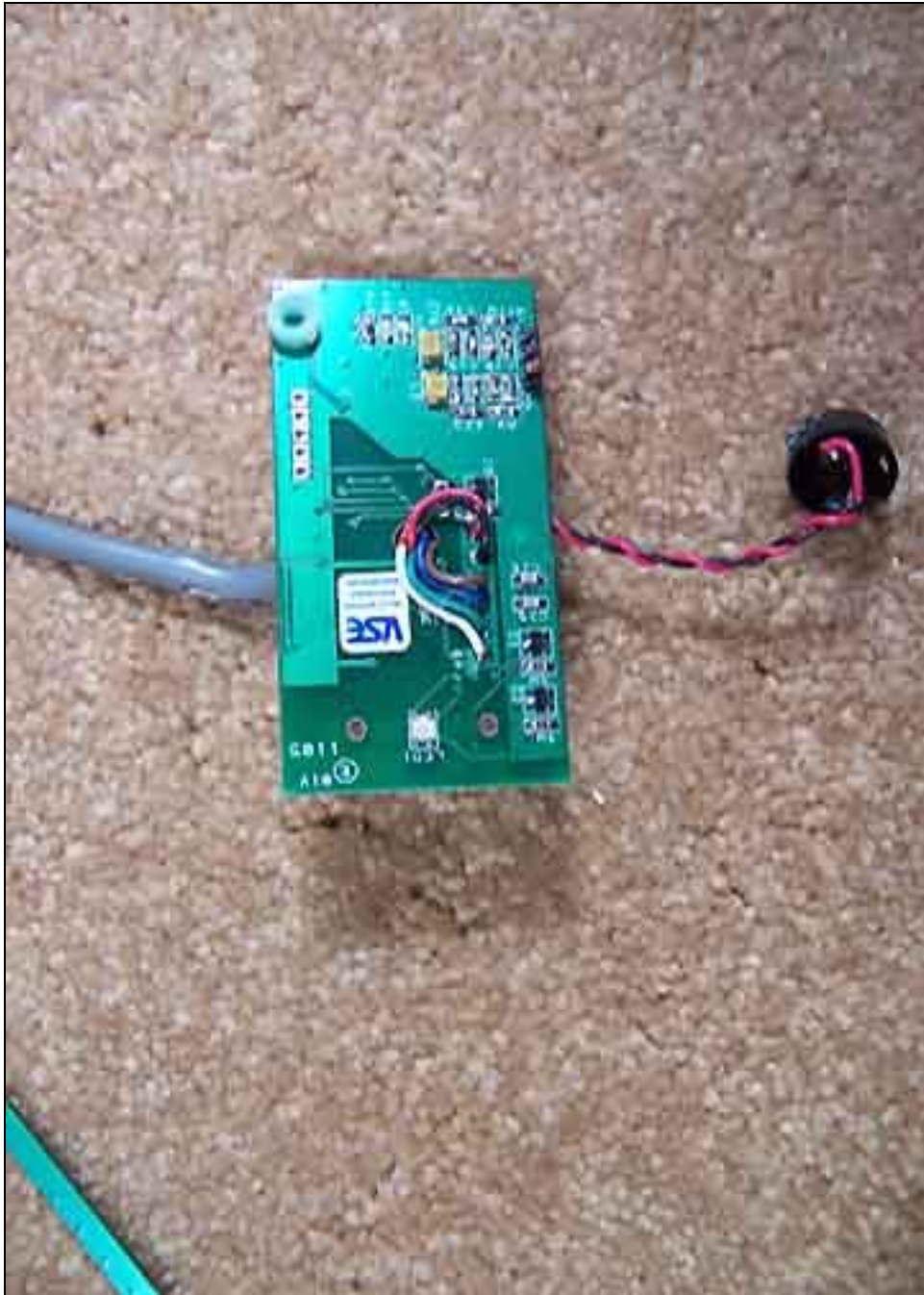
Main PCB Back