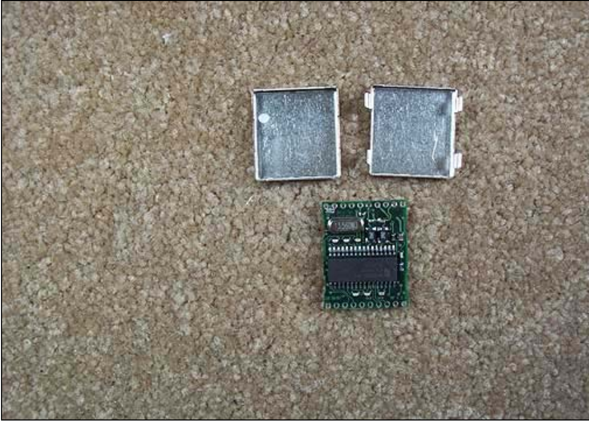
RF Can PCB Top