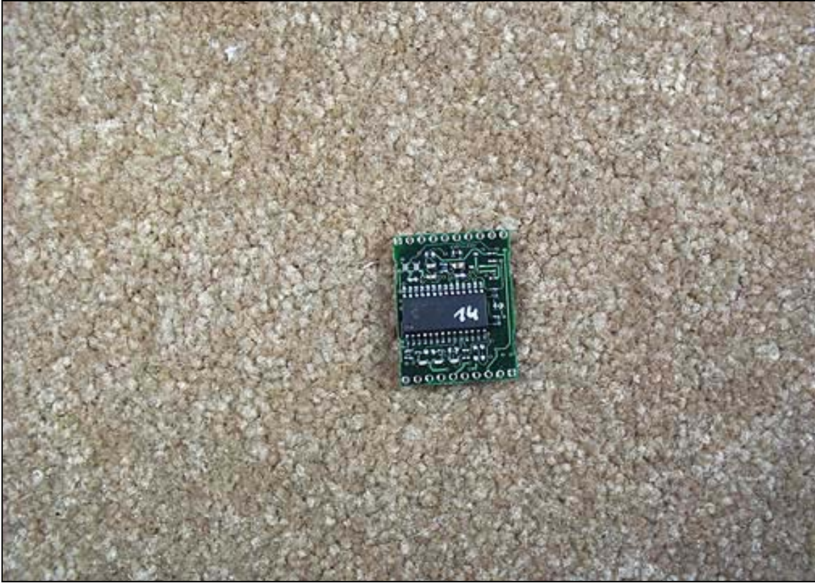
RF Can PCB Bottom