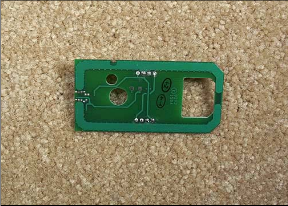
Antenna PCB Solder Side