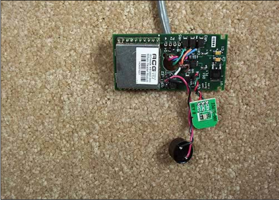
Main PCB Front