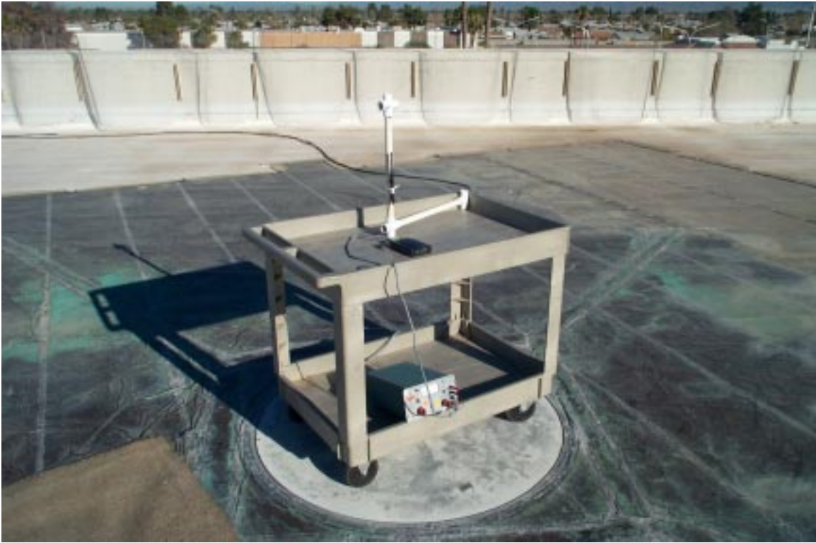
Figure H – 9 Mobile Station; Radiated Spurious Emissions Test Setup, OATS Setup