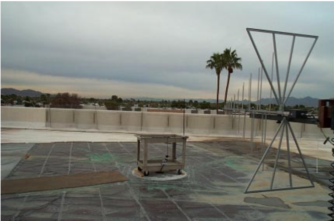
Figure H – 8 Base Station; Radiated Spurious Emissions OATS Test Setup, Photo #2