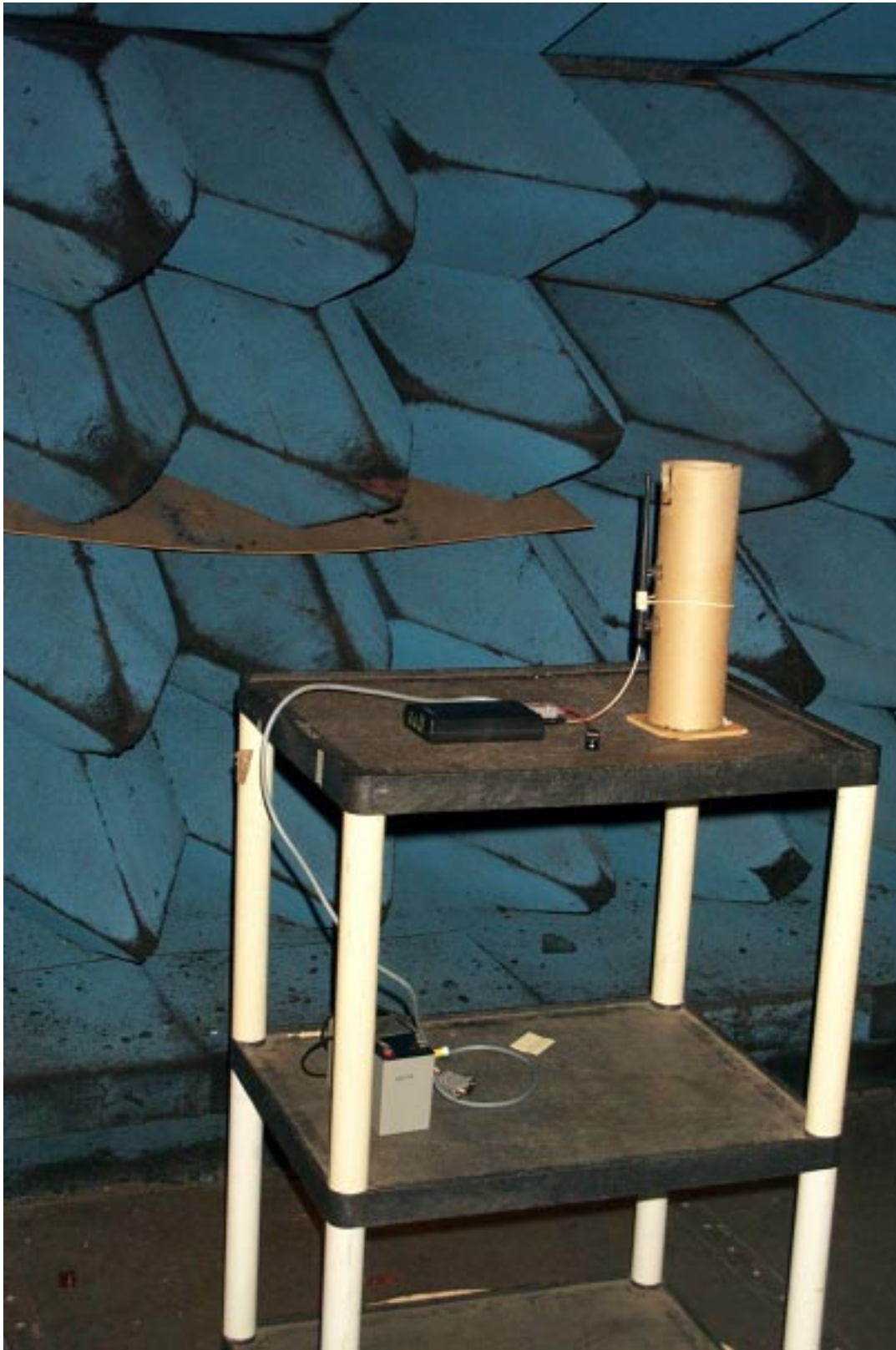
Figure H – 3 Mobile Station; Radiated Spurious Emissions Prescan Test Setup