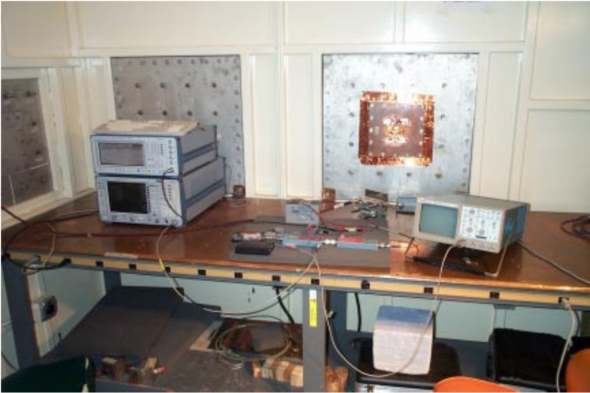
Figure H – 11 Processor Gain Test Setup; Inside Shielded Enclosure