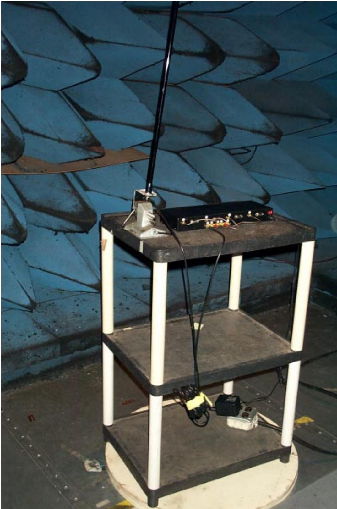
Figure H – 2 Base Station; Radiated Spurious Emissions Prescan Test Setup