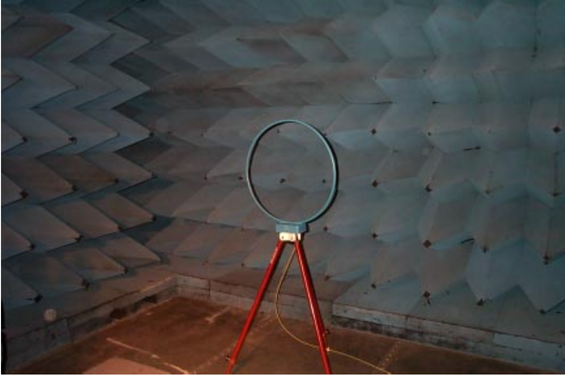
Figure H – 4 Radiated Spurious Emissions Prescan Test Setup, 9kHz - 30 MHz