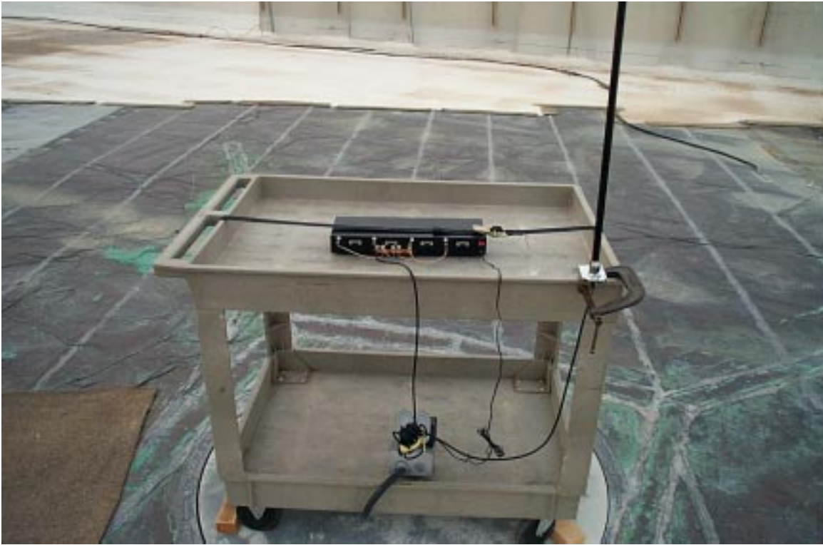
Figure H – 7 Base Station; Radiated Spurious Emissions OATS Test Setup, Photo #1