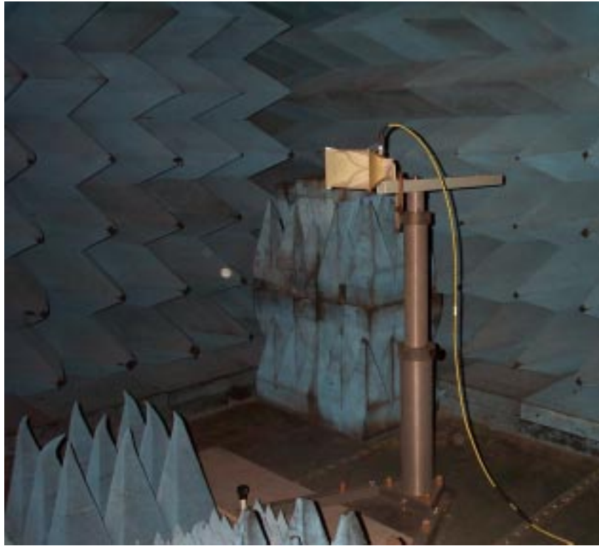
Figure H – 6 Radiated Spurious Emissions Prescan Test Setup, 1GHz - 10GHz