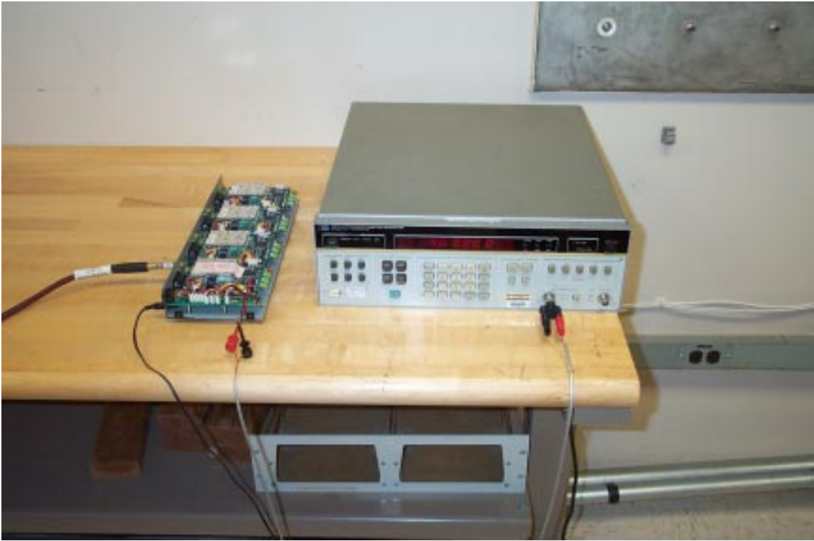
Figure H – 13 Processor Gain Test Setup; Outside Shielded Enclosure