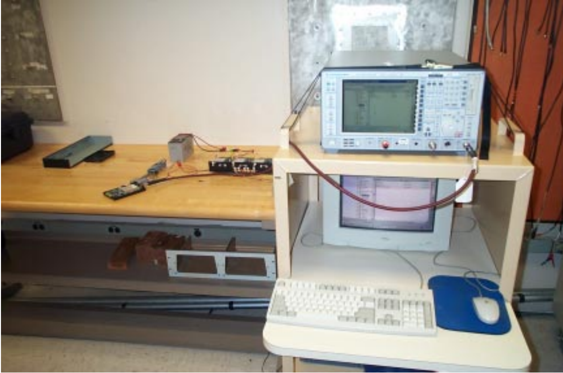
Figure H - 1 Antenna Conducted Measurement Setup