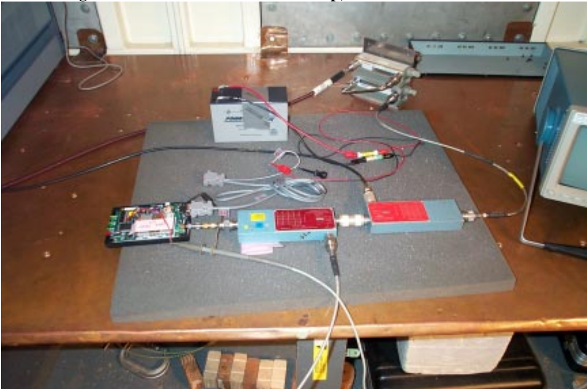
Figure H – 12 Processor Gain Test Setup; Inside Shielded Enclosure (Closeup)